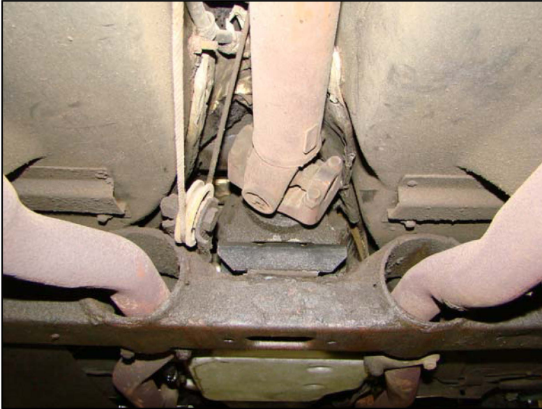
Fig # 1

Step 4: Once a final position has been chosen for the new system, evenly tighten all fasteners from front to rear. The supplied band clamps must be VERY tight to properly align the pipes and prevent leaks (Approximately 40ft-lbs). U-bolt clamps should be tightened to approximately 30-35ft-lbs. Inspect all fasteners after 25-50 miles of operation and retighten if necessary.