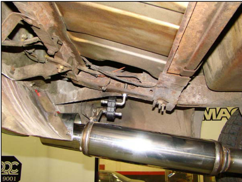
Fig # 2

Step 4: Once a final position has been chosen for the new system, evenly tighten all fasteners from front to rear. The supplied band clamps must be VERY tight to properly align the pipes and prevent leaks (Approximately 40ft-lbs). U-bolt clamps should be tightened to approximately 30-35ft-lbs. Inspect all fasteners after 25-50 miles of operation and retighten if necessary.