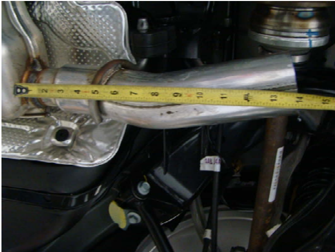
Fig. No. 1: Passenger Side.