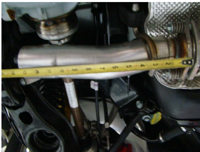
Fig. No. 2: Driver Side.

** Magnaflow Performance Exhaust recommends professional installation on all their products