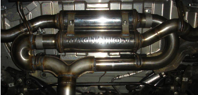
Fig 1. View from bottom

** Magnaflow Performance Exhaust recommends professional installation on all their products