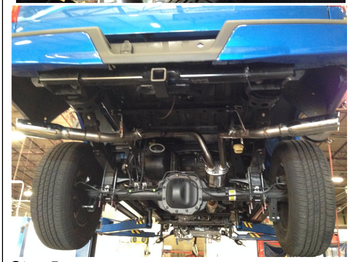
Step 5. To allow for the installation of a dual outlet system on a single outlet vehicle you will have top mount the supplied Hanger Brackets to existing holes in the factory frame rails using the supplied fasteners (8mm bolt and panel nut) as shown in the photos. Once completed you can now slide the Tailpipe assemblies onto the Over Axle pipes and fasten with the supplied 2.50" clamps and mount the hangers to the installed hanger brackets using the supplied rubbber insulators.