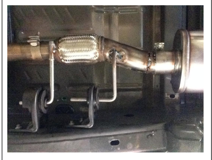
Step 2. Before installing your new MAGNAFLOW system the OEM spare tire and spare tire heat shield must be permanently removed. Install the new system by attaching the Inlet Pipe Assembly to the OEM catalytic converter outlet pipes using the existing clamp and hardware. Locate the welded hanger to the rubber insulator. Leave all clamps and fasteners loose for final adjustment of the complete system once installed.