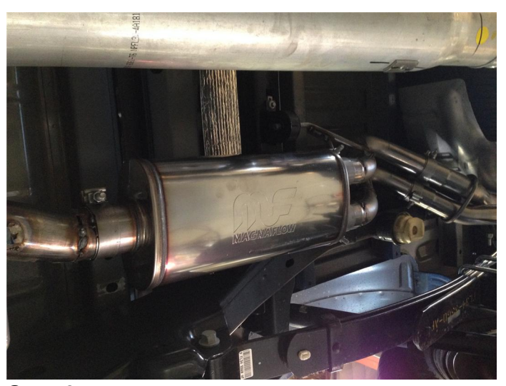
Step 3. Install the Muffler Assembly to the Inlet Pipe Assembly using the supplied 3.00" clamp.