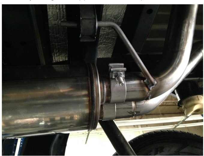
Step 4. Install both the Over Axle Pipes using the supplied 2.50" clamps. Locate the welded hanger to the OEM rubber insulator.