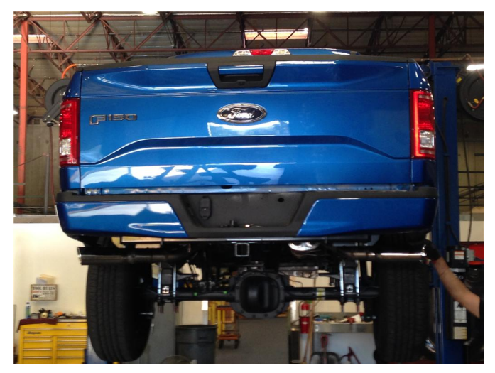
Step 6. Once a final position has been chosen for the new exhaust system, evenly tighten all clamps from front to rear using the torque specifications on page one of the instructions. Inspect all fasteners after 25-50 miles of operation and re-tighten if necessary.