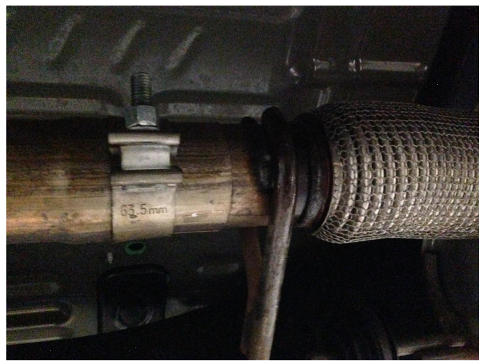
Step 1. To remove the OEM exhaust system, loosen the clamp attaching the systems inlet pipes to the catalytic converter outlet pipes. Disengage all welded hangers from the OEM rubber insulators. Do not discard the OEM fasteners or damage the rubber insulators as they will be needed to mount your new MAGNAFLOW system.