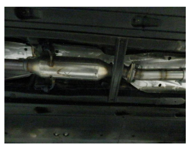
Step 2. This Magnaflow exhaust system will fit both a 2.0LTurbo and a NA 2.4L Optima depending on which Inlet pipe Assembly is used (both are supplied). The 2.0L Turbo Inlet Pipe has the slotted flange. Begin installation of the new system by fastening the correct Inlet Assembly to the resonator outlet using the OEM fasteners (Leave all clamps and fasteners loose for final adjustment of the complete system.)