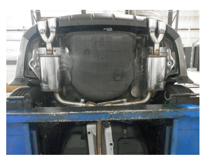
Step 4. Finish by Installing the Muffler Assemblies to the outlets of the Resonator Assembly using the supplied 2.50" clamps. Insert hangers into rubber insulators.