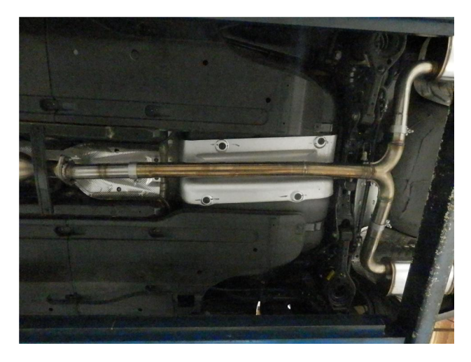
Step 3. Next Install the Y-Pipe Assembly to the Inlet Pipe Assembly using the supplied 2.50" clamp. Insert hanger into rubber insulator.