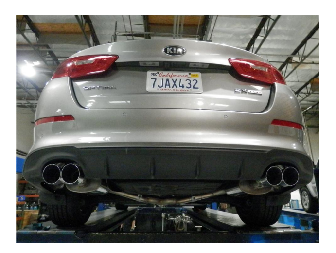
Step 5. Once a final position has been chosen for the new exhaust system, evenly tighten all clamps from front to rear using the torque specifications on page one of the instructions. Inspect all fasteners after 25-50 miles of operation and re-tighten if necessary.