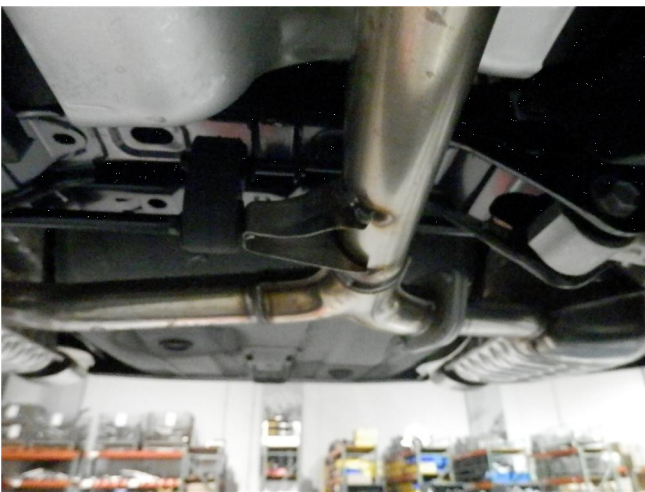
Step 1. To extract the OEM exhaust system begin by un-fastening the flange located behind the resonator and the second flange located in front of the Driver side muffler assembly. Next, working rearward, disengage all welded hangers from the rubber insulators. Do not damage or discard the rubber insulators or fasteners as they will be re-used to mount the new system. You can now remove the exhaust from the vehicle.