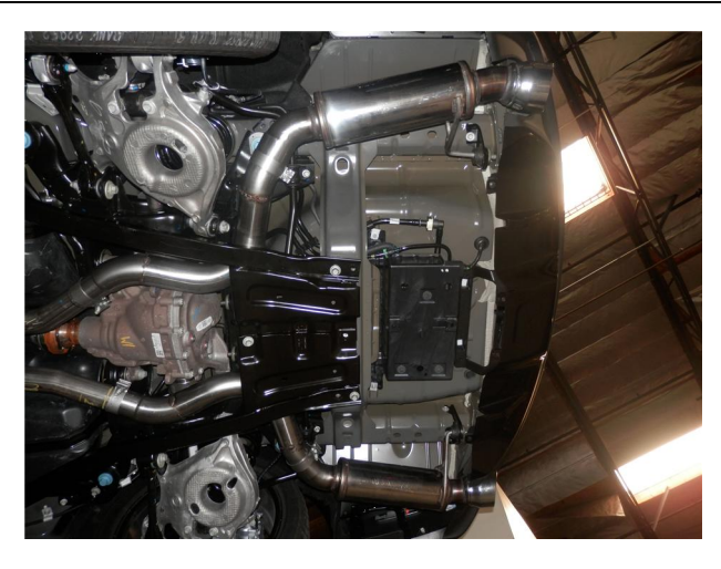
Step 3. Next attach both Muffler Assemblies to the Inlet Pipe Assemblies using the supplied 3.00" clamps and fitting the hangers into the rubber insualtors.