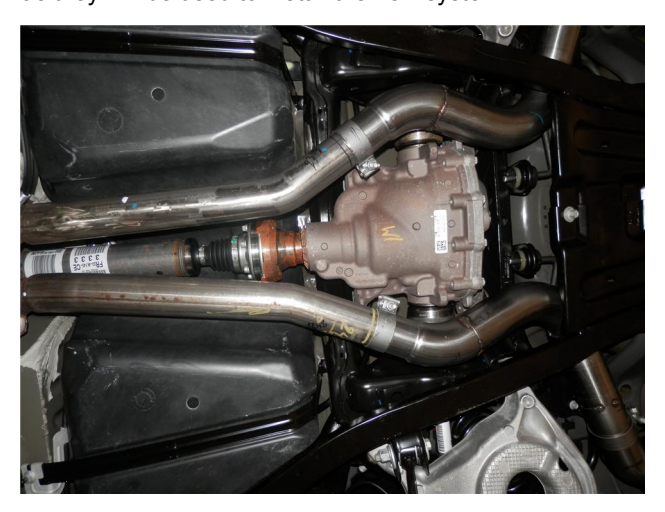
Step 2. Begin installation of the new system by attaching both Inlet Pipe Assemblies to the pipes you have just cut. Loosely secure using the supplied 2.50" clamps. Engage the welded hangers to the rubber insulators. Leave all clamps loose until final adjustment.