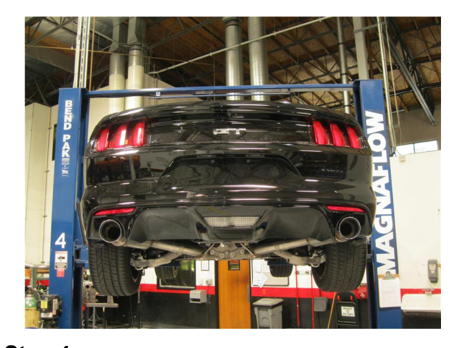
Step 4. Once a final position has been chosen for the new exhaust system, evenly tighten all clamps from front to rear using the torque specifications on page one of the instructions. Inspect all fasteners after 25-50 miles of operation and re-tighten if necessary.