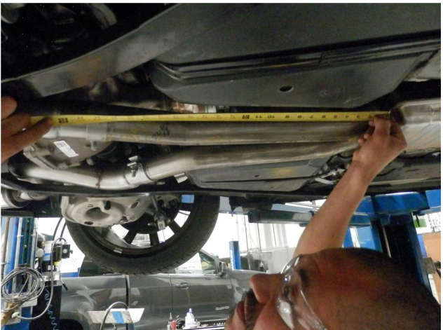
Step 1. Begin removing the OEM exhaust system by cutting both pipes exiting the resonator. Measure and cut 23.5" (driver side) and 24.5" (passenger side) from the rear of the resonator. Next, extract the hangers from the rubber insulators and remove the OEM mufflers. Retain insulators as they will be used to install the new system.