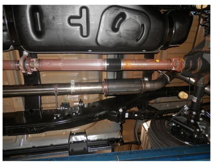
Step 5. Next loosely install the Muffler Assembly to the Inlet Pipe Assembly or Extension Pipe using the supplied clamp. Engage the welded hanger to the rubber insulator.