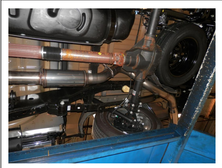
Step 6. Loosely install the Tail Pipe Assembly using the supplied clamp. Engage the welded hanger to the rubber insulator.