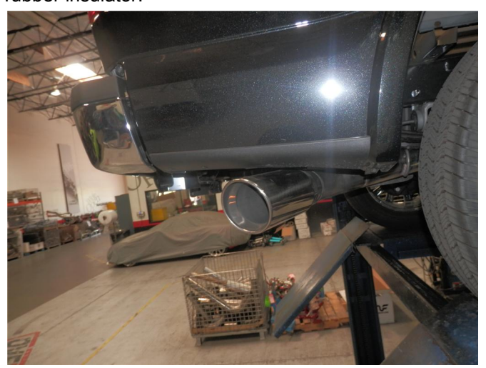
Step 7. Once a final position has been chosen for the new exhaust system, evenly tighten all clamps from front to rear using the torque specifications on page one of the instructions. Inspect all fasteners after 25-50 miles of operation and re-tighten if necessary.