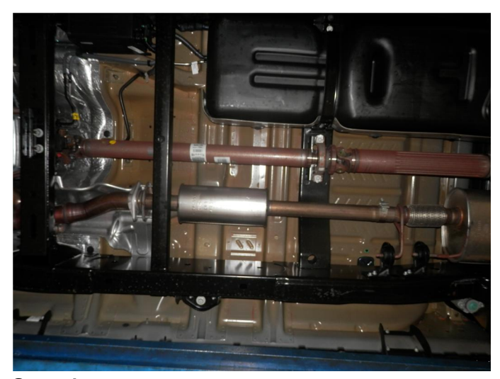
Step 1. To remove the OEM exhaust loosen the factory clamp in front of the muffler, loosen the bolts attaching the inlet pipe assembly to the inlet flange junction. Rotate the extension pipe to release the muffler inlet locking boss. Remove the inlet flange bolts. Working front to rear disengage all welded hangers from the rubber insulators. Be sure to retain all mounting hardware as it will be needed to install your new MAGNAFLOW system.