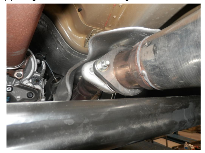
Step 3. Begin installation by loosely attaching the Inlet Pipe Assembly to the OEM flange outlet using the supplied hardware.