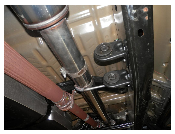
Step 4. Loosely install the supplied Hanger Clamp Assembly to either the Inlet Pipe Assembly or the Extension Pipe, depending on your vehicle configuration. Locate the welded hanger to the secondary rubber insulator as shown.