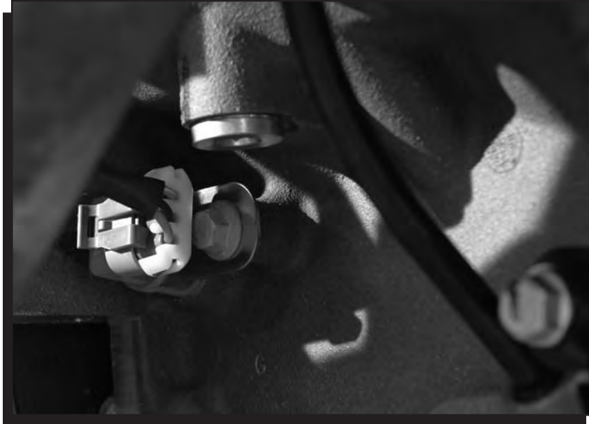
Figure 3 Crank Trigger Sensor Location.

The Crank Trigger Sensor is located on the rear passenger side of the block, just above the starter (Figure 3).