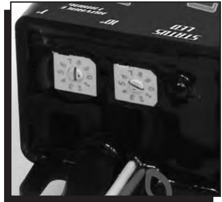
Figure 1 Timing Adjustment.

There are two rotary dials in the Converter that provide adjustment of the timing from TDC to 50° BTDC. The timing is adjustable in one degree increments.