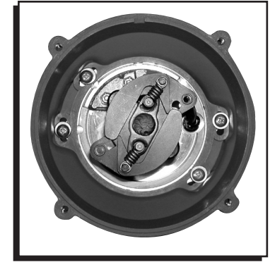
Figure 2 Installing the Adapter Base.