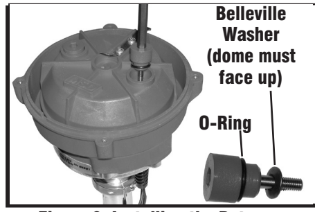
Figure 3 Installing the Rotor