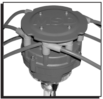
Figure 5 Installing the Wire