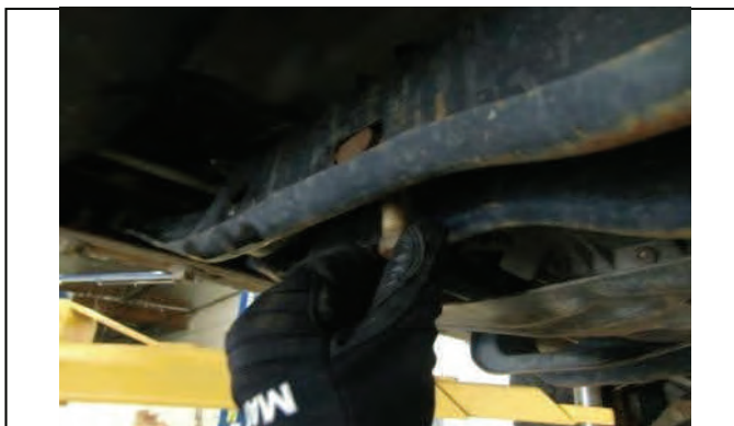
Reinstall adjustment bolt by hand to snug, initial setting