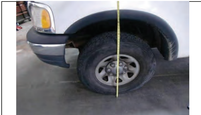
Place vehicle on level surface and take measurement