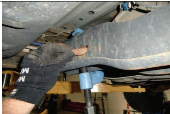
Use torsion key unloading tool to remove adjustment block