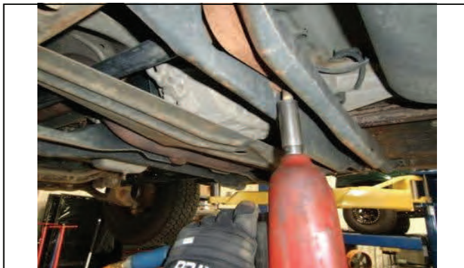
Remove torsion key adjustment bolt