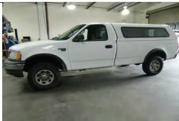
Lower vehicle, reattach shocks and take measurements