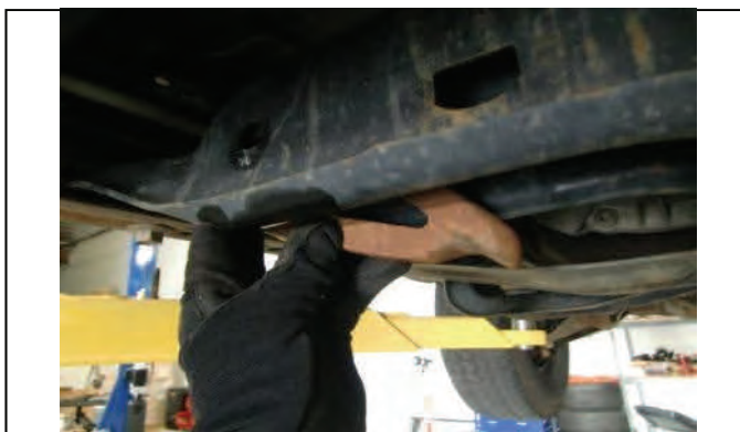
Slide torsion bar forward and remove OE key