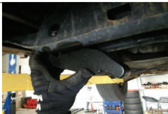
Install new key, reposition torsion bar and reinstall adj. block