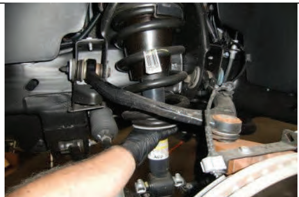
Remove entire strut assembly from vehicle.