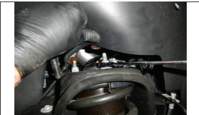
Remove upper strut mounting nuts