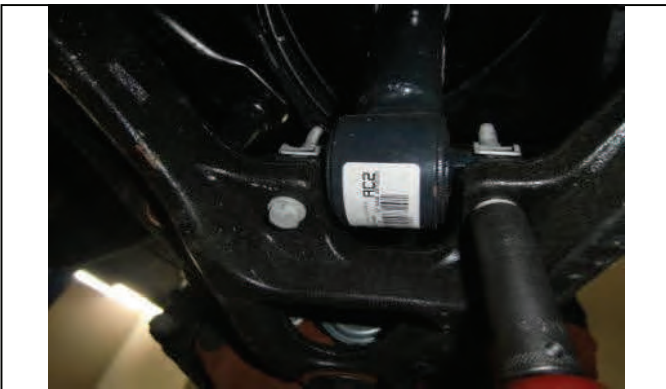
Remove lower strut mounting bolts