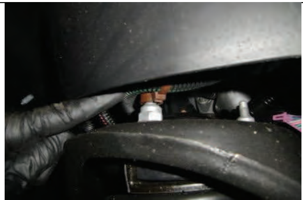
Pry up ABS retaining clips from upper strut mounting nuts