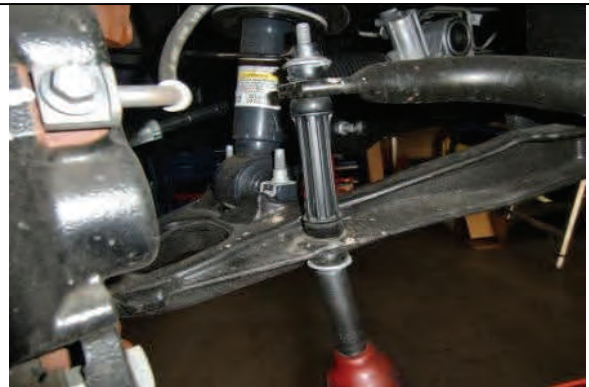
Disconnect dr/pass sway bar end links