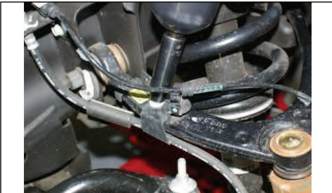
Disconnect ABS/brake bracket from upper control arm.