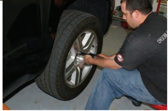
Remove front wheels/tires