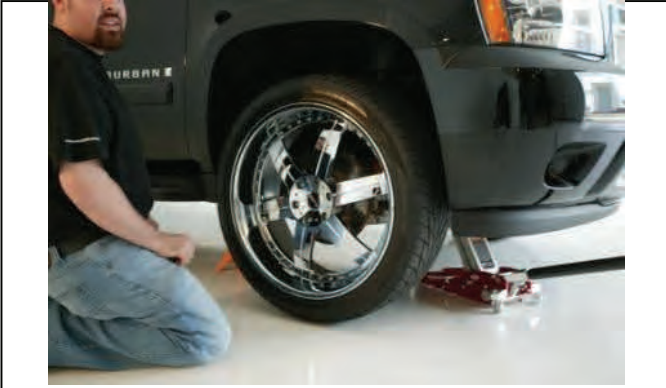
Raise and support front of vehicle frame on jack stands