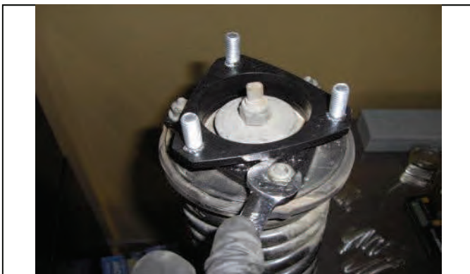
Attach new strut extension with OE hardware