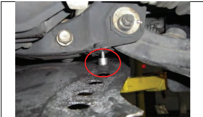
4WD Reattach skid plate with provided spacers and hardware