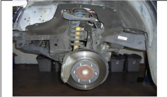
Raise and support vehicle by frame