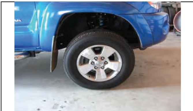
Reconnect sway bar links, install wheels/tires torque to spec.