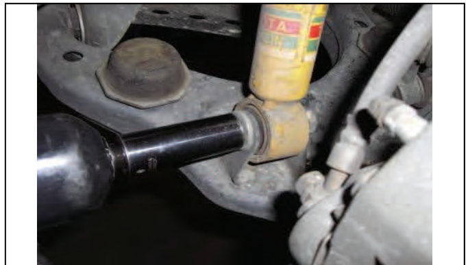
Disconnect lower strut mounting hardware