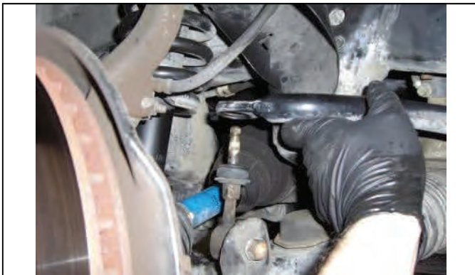
Shows earlier model sway bar end links