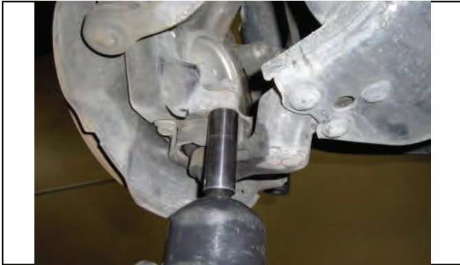
Reattach lower ball joint bolts and tighten