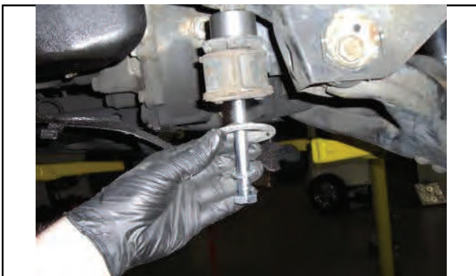
4WD Install longer bolts and reattach differential to frame