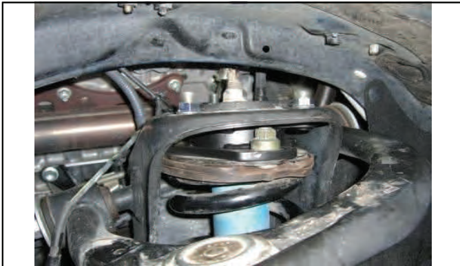
Rotate 180 deg., reattach upper strut with provided hardware