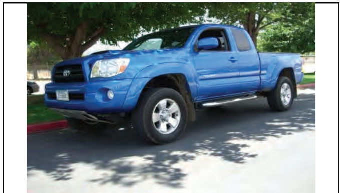
Test drive, align and enjoy your leveled vehicle.