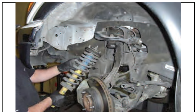
Remove strut from vehicle