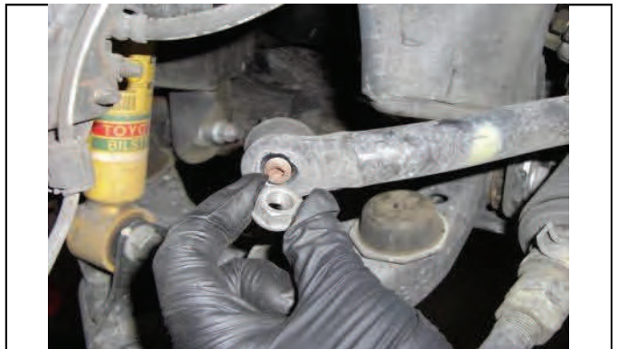
Reconnect sway bar end links. Move to the rear installation