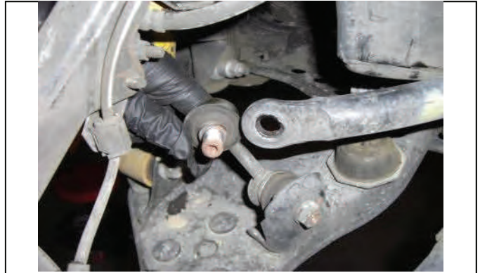
Disconnect both sides sway bar end links