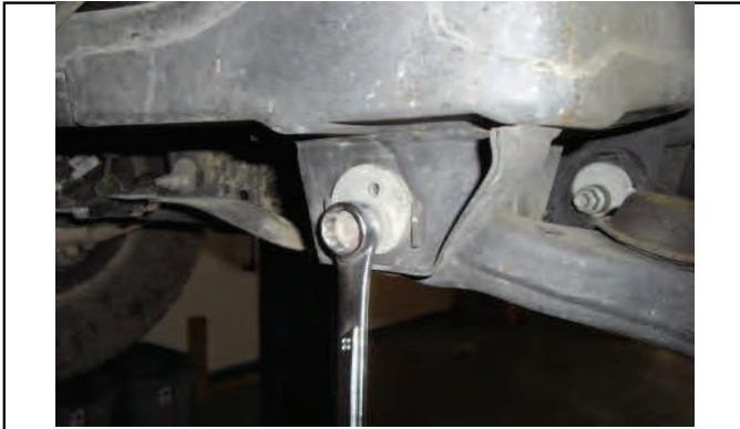
Mark and loosen lower control arm bolts, do not remove