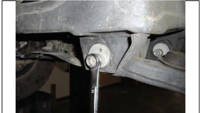
Reset and tighten lower control arm bolts