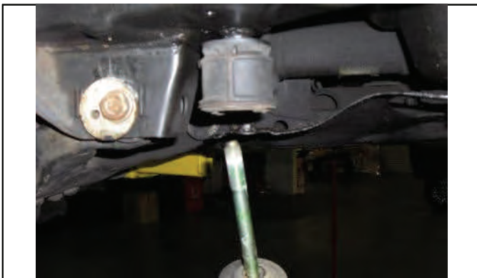
4WD Support differential and remove (2) front mounting bolts