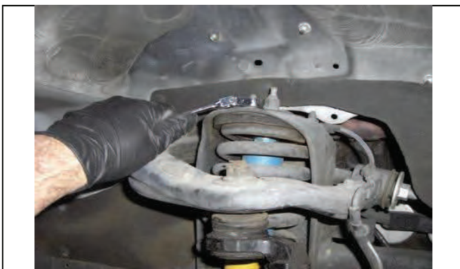
Disconnect upper strut mounting hardware