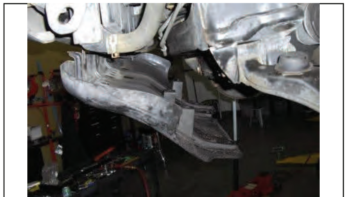
4WD models and 2.5-3.0" kits remove front skid plate