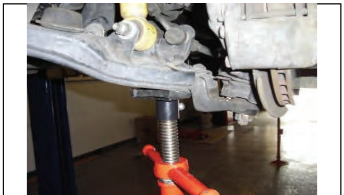
Raise lower control arm and attach lower strut mount