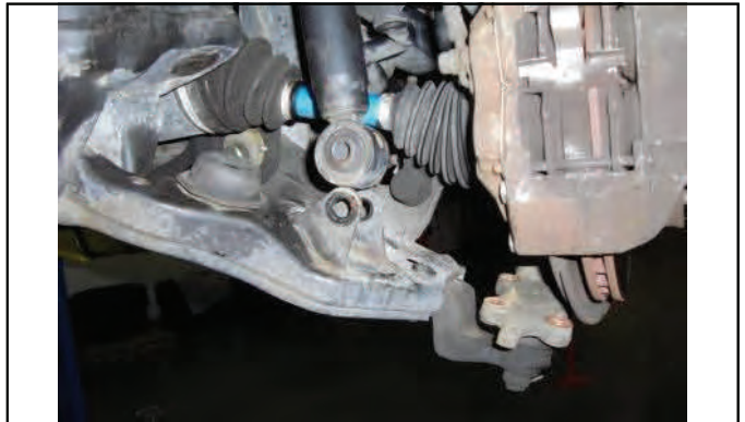
Lower control arm if necessary to install lower mount