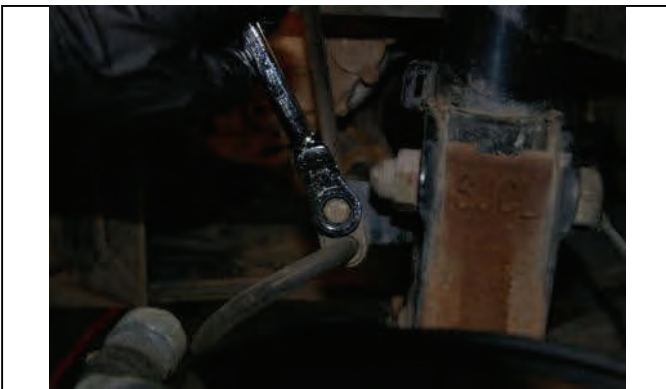
Unbolt brake line from strut