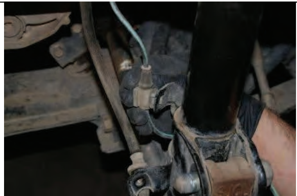
Reattach all ABS line clips

Torque all fasteners to spec and reinstall wheels/tires. Proceed to the rear and follow these steps. Once the vehicle is finished recheck all work performed and test drive vehicle and have your vehicle aligned.