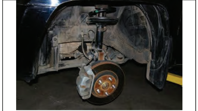
Begin at the front of the vehicle