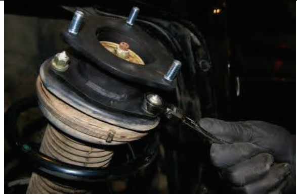
Attach strut extension to strut top with OE hardware, torque