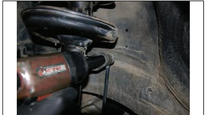
Disconnect and remove front sway bar end links