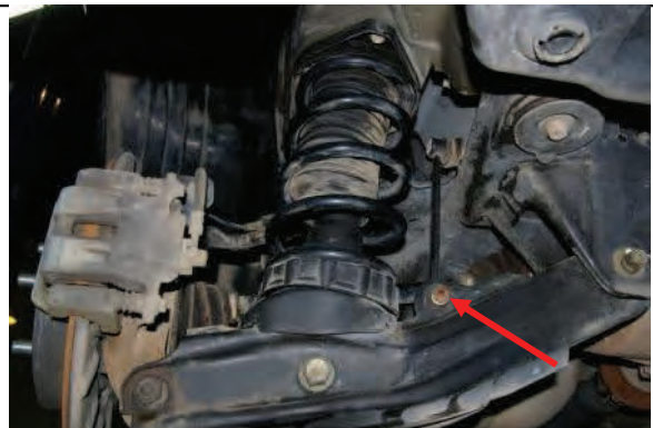
View of the rear suspension, disconnect sway bar endlink

Torque all fasteners to spec and reinstall wheels/tires. Proceed to the rear and follow these steps. Once the vehicle is finished recheck all work performed and test drive vehicle and have your vehicle aligned.