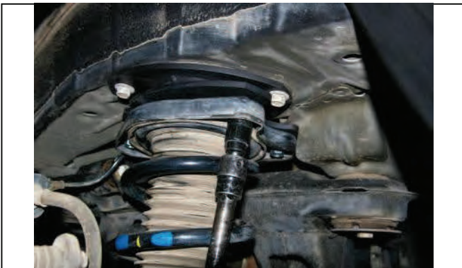
Reinstall strut into vehicle and attach with new nuts