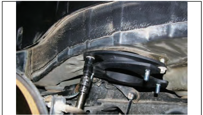
Attach rear spacer to vehicle with OE hardware