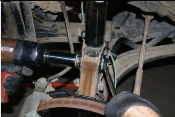
Reattach lower strut mount, push down to clear top mount