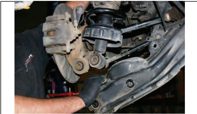
Push down lower control arm, lift strut up and out