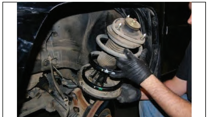
Lower suspension and remove strut. Caution: CV boot