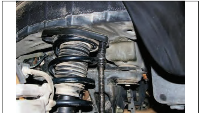
Unbolt upper strut mounting bolts from unibody