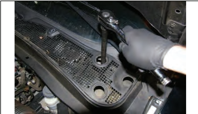
Under the hood remove upper strut mount access holes (3)