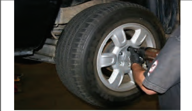
Raise and support vehicle frame on stands, remove wheels