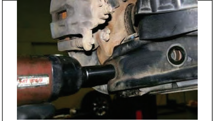
Unbolt lower control arm from spindle