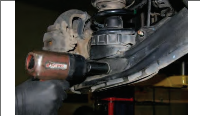
Unbolt lower strut mounting hardware