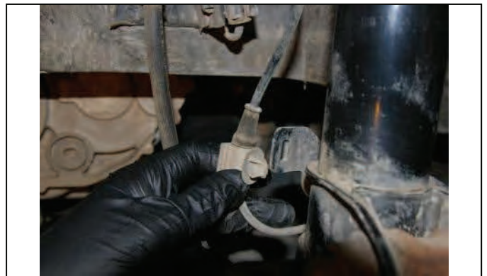
Unclip all ABS lines mounts on strut and at the frame