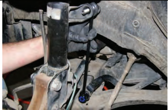
Raise jack attach top strut mount and new sway bar endlink