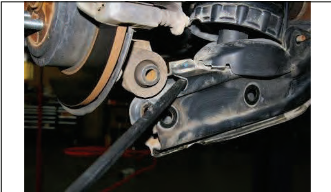
Use pry bar to separate spindle from lower control arm