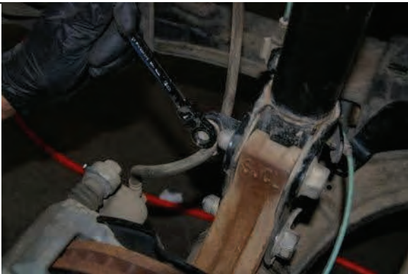
Reattach brake line bracket