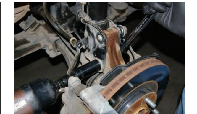
Support suspension with jack and unbolt strut from spindle