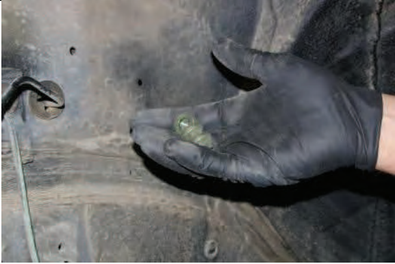
Retrieve OE upper strut mounting nuts from unibody frame