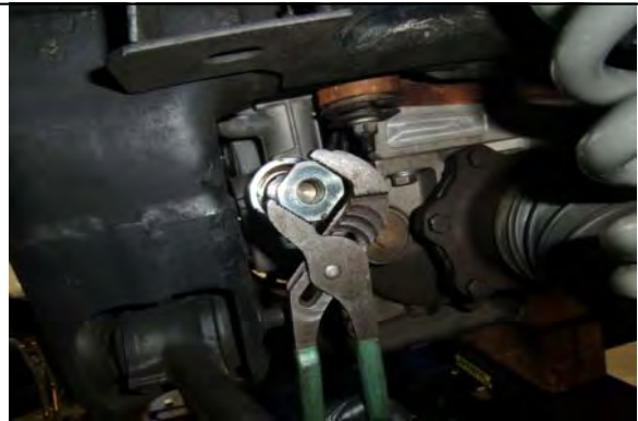
Clean rack threads and install & torque steering rack adapter.