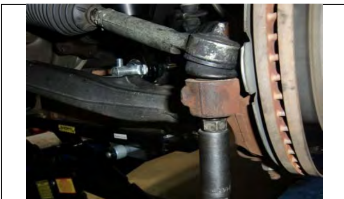
Remove outer tie rod nut at spindle