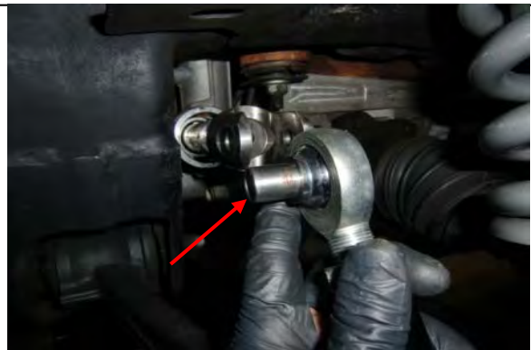
Insert reducer sleeve into sm. heim end and insert into clevis