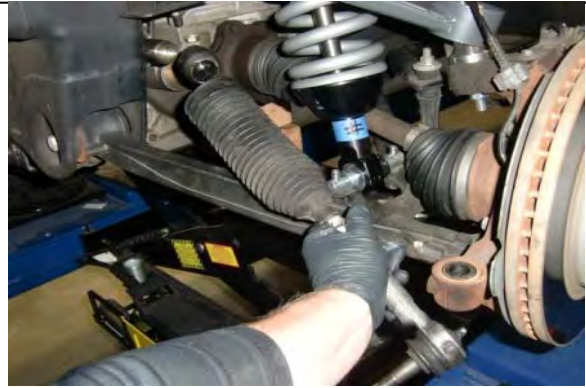
Remove entire inner/outer tie rod assembly.