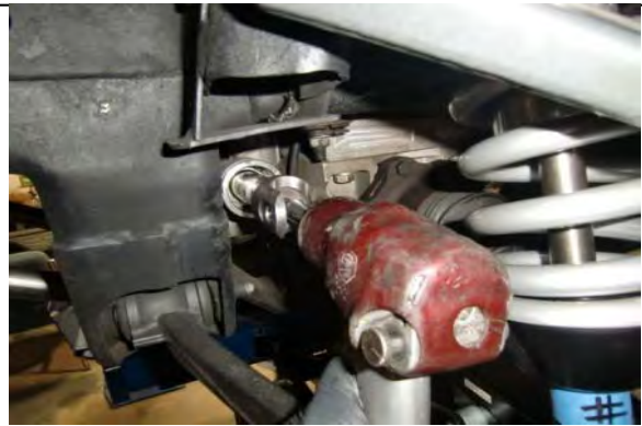
Tighten to spec with clevis positioned as shown, (vertical)