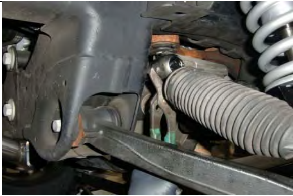
Loosen inner tie rod socket at the steering rack.