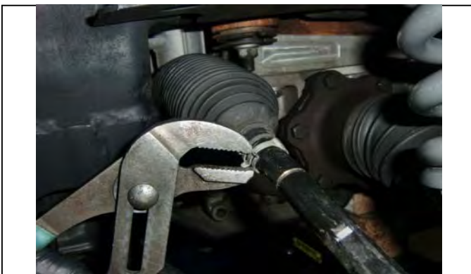
Remove spring clip on inner tie rod