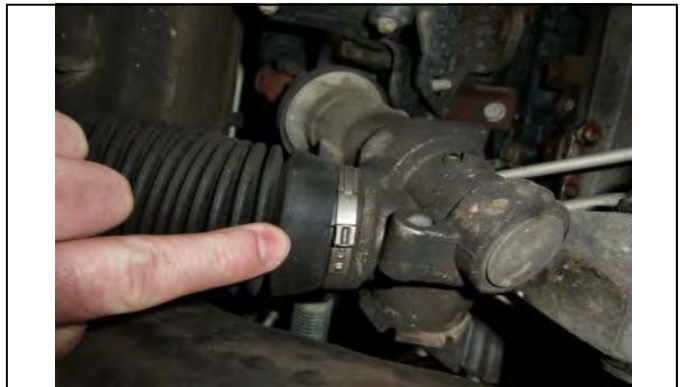
Cut remove metal clamp from steering rack