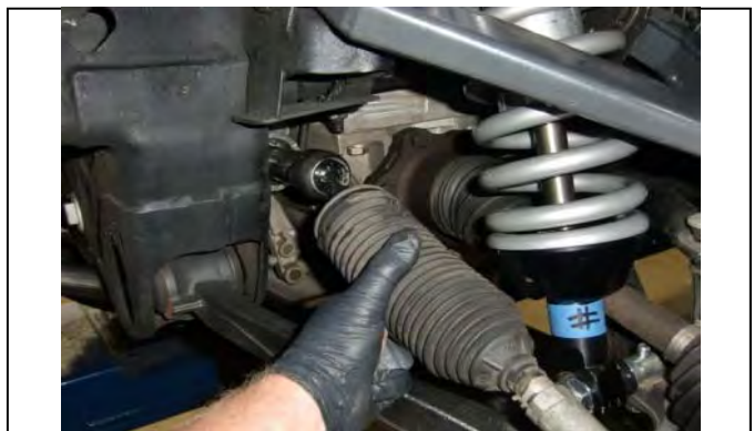
Slide boot off steering rack to expose inner tie rod socket