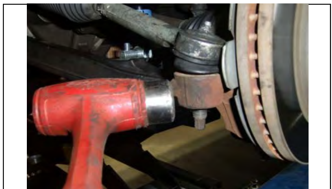
Strike with hammer to disconnect joint from spindle