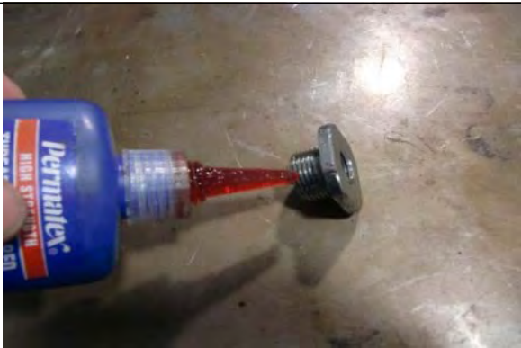
Note: Vehicles requiring rack adapters, use thread locker