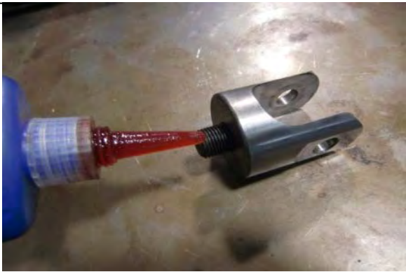
Note: Use thread locking compound on clevis mounting bolt