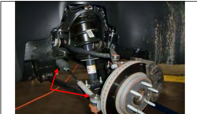
Photo shows inner/outer tie rod assembly