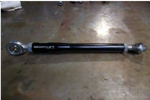
Picture of assembled steering assembly