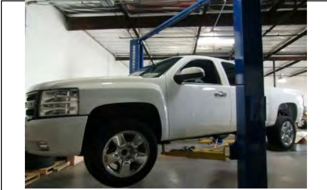
Securely lift front of vehicle and support frame