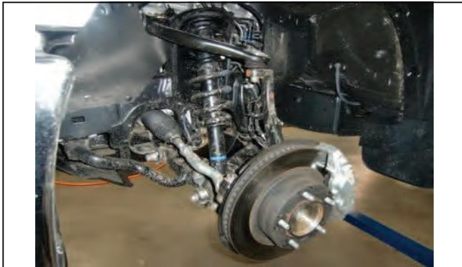
Photo shows front suspension