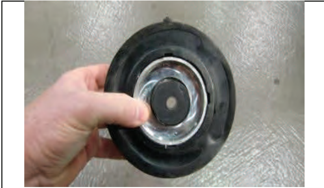
Place OE shaft bushings in original locations as shown