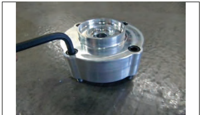
Tighten allen socket bolts