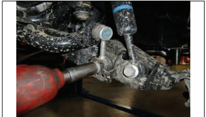
Disconnect lower sway bar end links