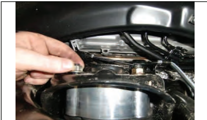
Reinstall strut using provided hardware on top, OE on lower