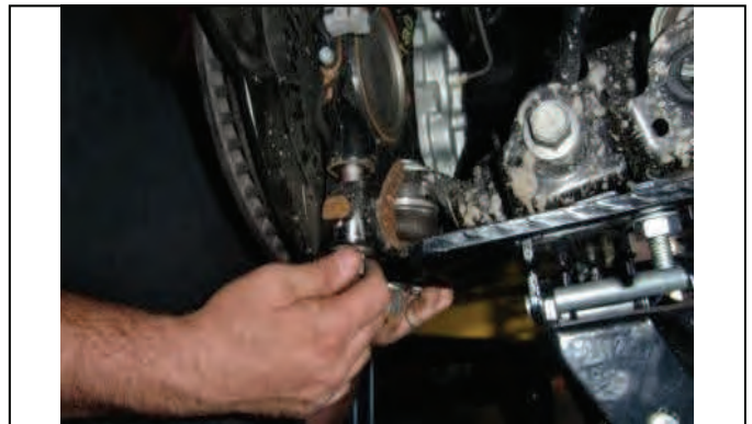
Use a jack, attach lower ball joints bolts, start by hand