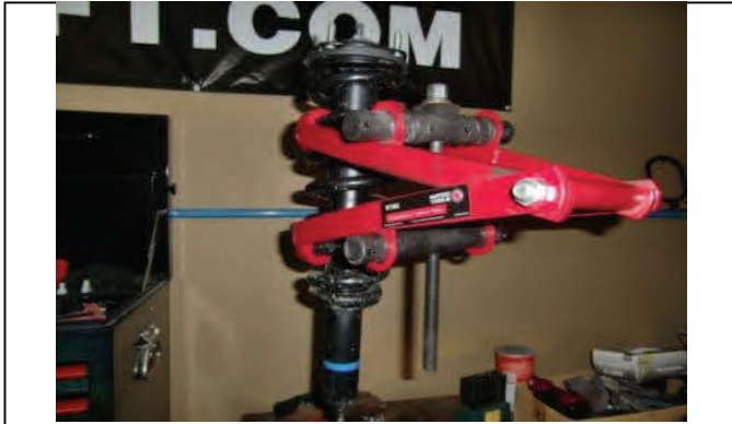
Use appropriate spring compressor for strut disassembly