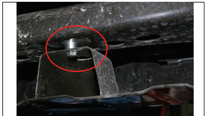
Install (2) skid plate spacers with new hardware