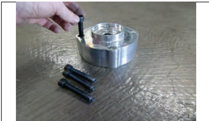
Install provided bolts into T6 billet spacer countersunk holes