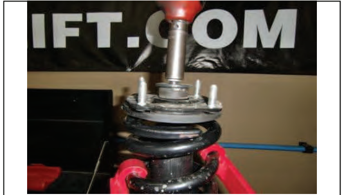
Remove retaining hardware, set aside, it will be reused