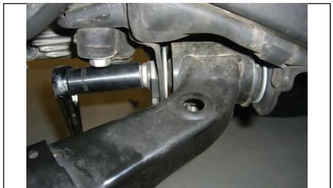
Loosen lower control arm bolts but do not remove