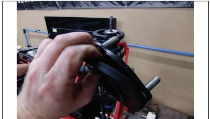
Remove OE upper spring isolator