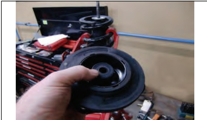
Remove top and bottom strut shaft bushings