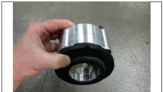
Place upper spring isolator on new upper strut hat