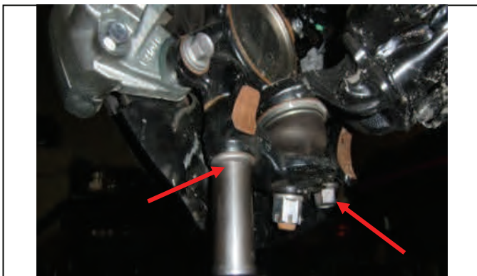
Remove lower ball joint mounting bracket bolts