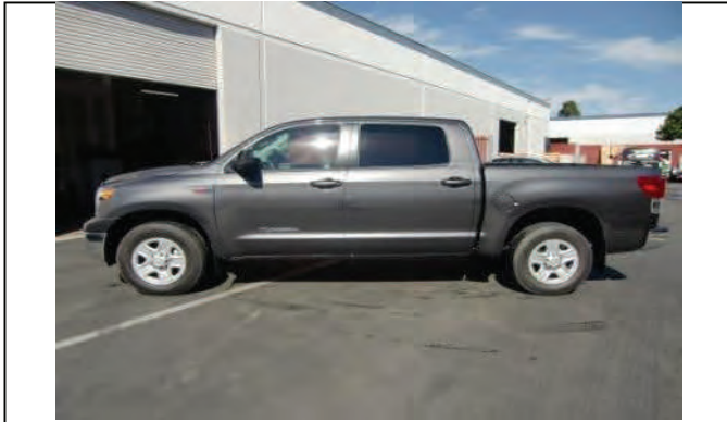
Raise and support frame with jack stands