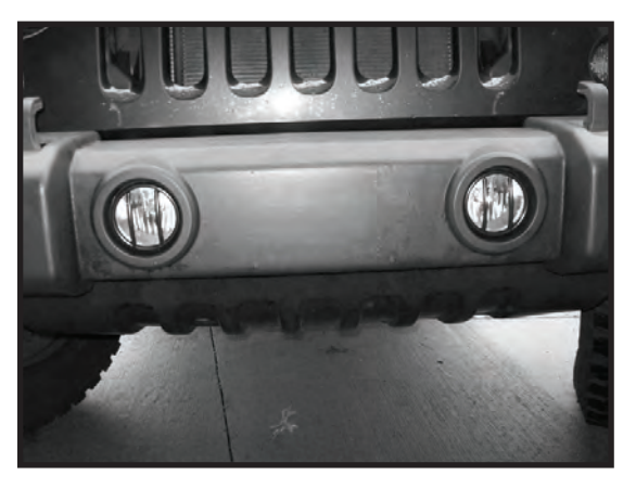
Page 2 of 2

5. From the front of the vehicle, check to make sure O-rings are properly seated between the Euro Guards and the bumper.