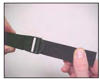
Figure 1 Figure :