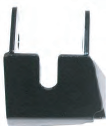
LH Side Passenger