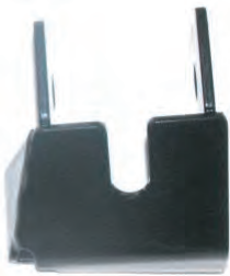
RH Side Driver