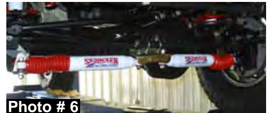
Photo # 6