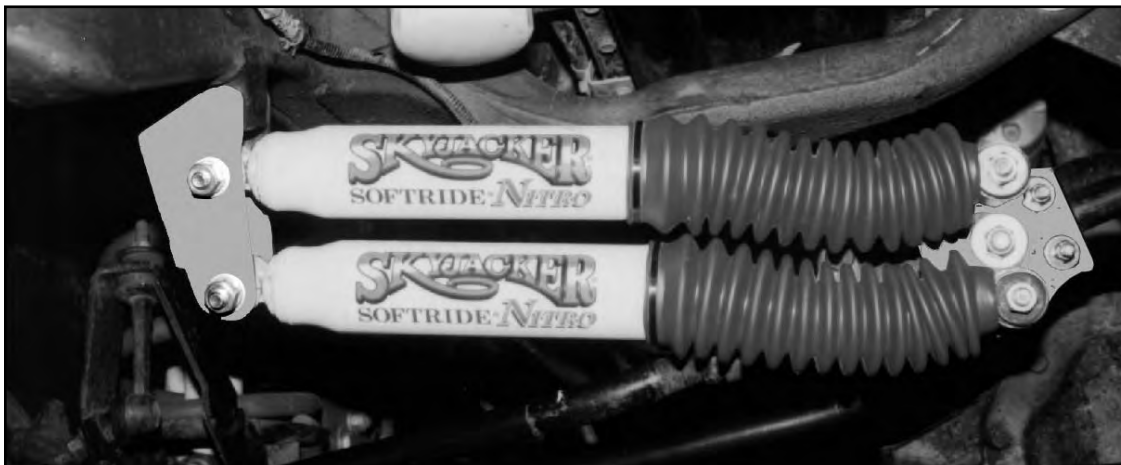
Dual Steering Stabilizer Available, #7217