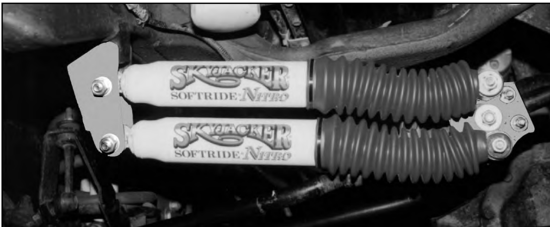
Dual Steering Stabilizer Available, #7217