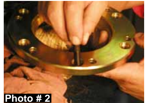
Photo # 2