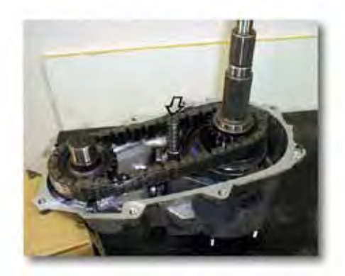
(Fig. 5A) New Main Output Shaft Assembly

(3) Output shaft and drive chain assembly: (a) Lubricate chain & shaft with ATF. (b) Insert main shaft assembly into the housed planetary assembly. (c) Install the drive chain onto the front output shaft. (d) Insert them into the hearing. Lift