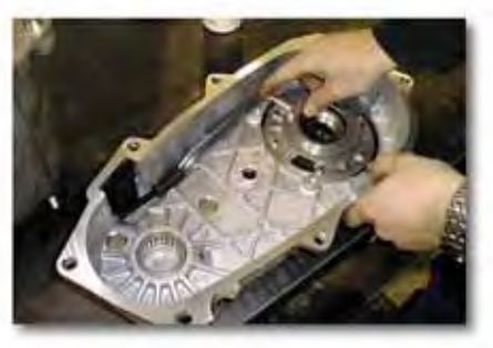
(Fig. 6A) Case Half Pre-assembly

(4) Make sure the mode spring is in place, seen in the middle. (Fig. 5A)