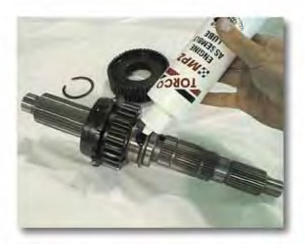
(Fig. 3A) New Main Output Shaft Assembly

These bearings must be removed. Once the bearings are removed, clean the inside of the drive gear to make sure it is free of any type of debris.