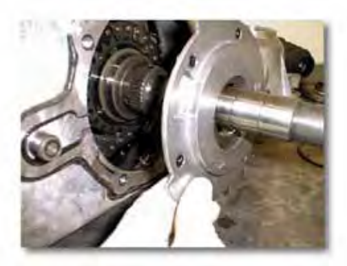
(Fig. 9) Oil Pump Removal

(11) Disconnect the pump pickup tube visible at lowest point of tailhousing opening. (Fig. 9) (a) Remove the pump from the main output shaft.