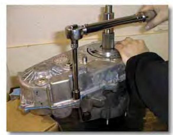
(Fig. 8A) Case Halves Assembled