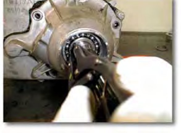
(Fig. 7) Rear I.D. Snap Ring Removal

Remove rear seal. Collapse with punch if needed.