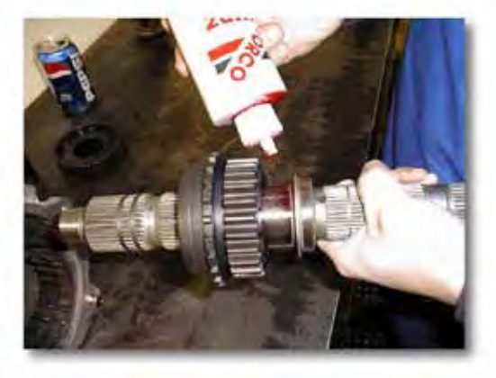
(Fig. 3A) New Main Output Shaft Assembly