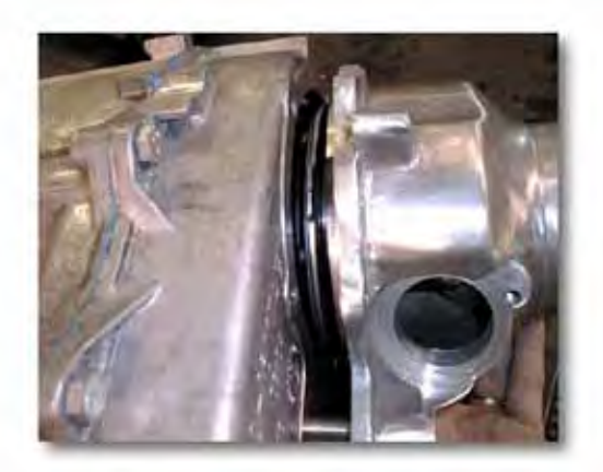
(Fig. 12A) Tailhousing Installation