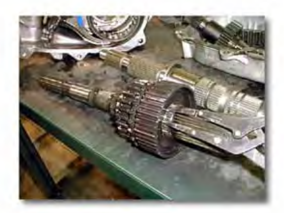
(Fig. 12) Front Drive Chain & Shaft Removal

(15) Rear output shaft removal: (a)Grasp the main shaft and remove the shaft, drive sprocket and mode hub assembly.