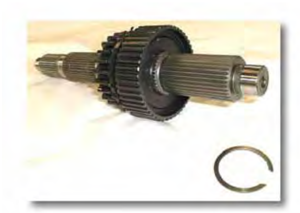
(Fig. 4A) (Large) Retaining Ring Installation