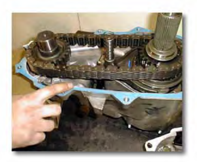
(Fig. 7A) Thin film RTV Applied Prior to Mating Case Halves.

(6) Apply a thin film of sealant to the front case. Use a good RTV, like the OEM sealant, available from your local Jeep dealer. (Fig. 7A) P/N = 82300234.