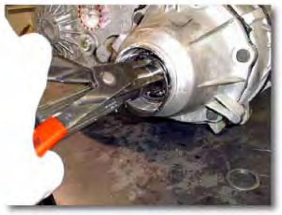
(Fig. 6) Rear O.D. Snap Ring Removal

(9) Remove rear bearing retaining rings. (Fig. 6) & (Fig. 7)