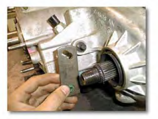
(Fig. 2) Range Selector Removal