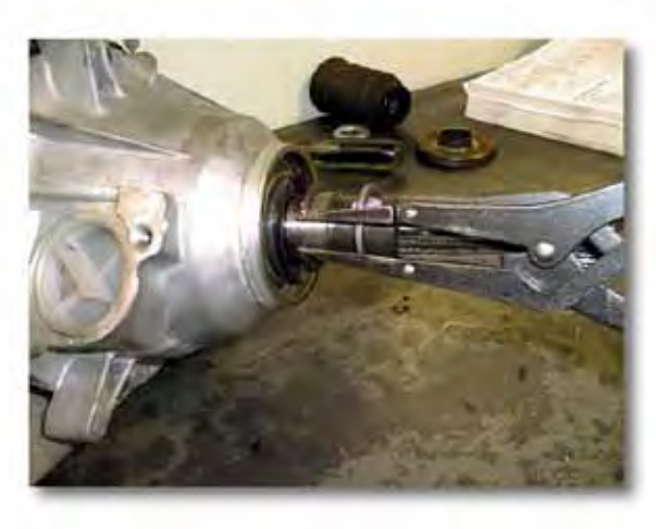
(Fig. 4) Stop Spacer & Snap Ring Removal