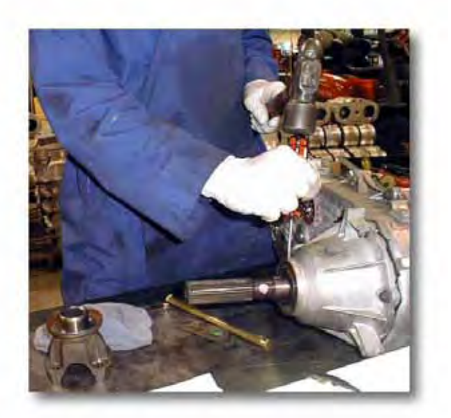
(Fig. 5) Rear Seal Removal

Remove rear seal. Collapse with punch if needed.