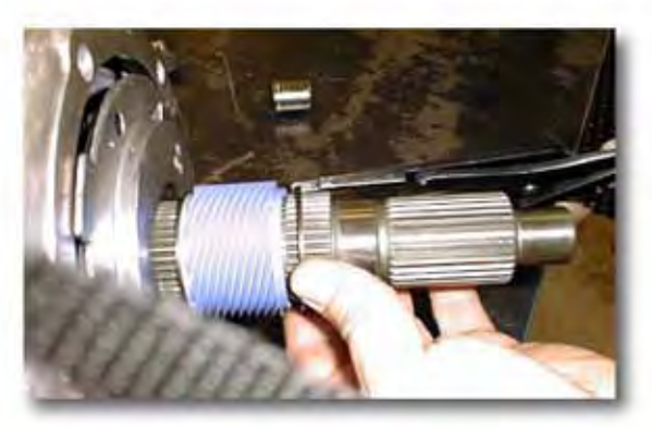
(Fig. 9A) Speed-o- Ring Gear Install