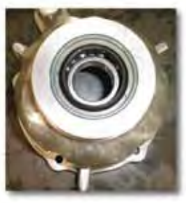
(Fig. 11A) Seal Installed