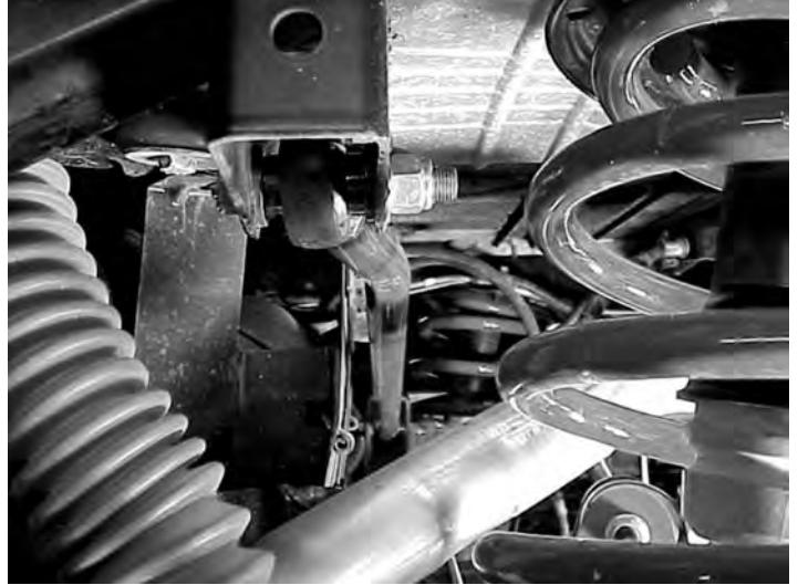
Rear Trackbar installed (notice the location of the bend)