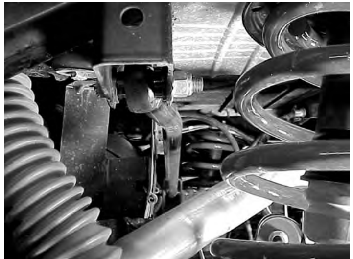
Rear Trackbar installed (notice the location of the bend)