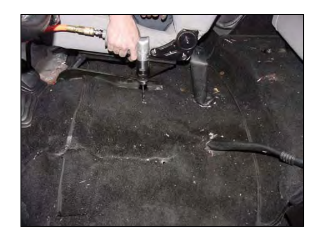
Figure 3 Figure 4

For Technical Support/Warranty Information please call 310-762-9944