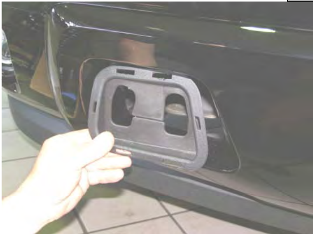
Fig 1 (Passenger Side)