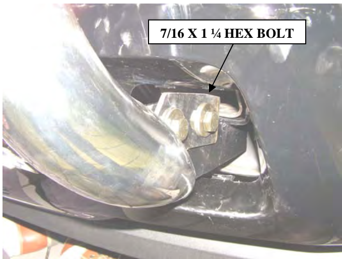
Fig 3 ( Driver Side)

For Technical Support/Warranty Information please call 310-762-9944