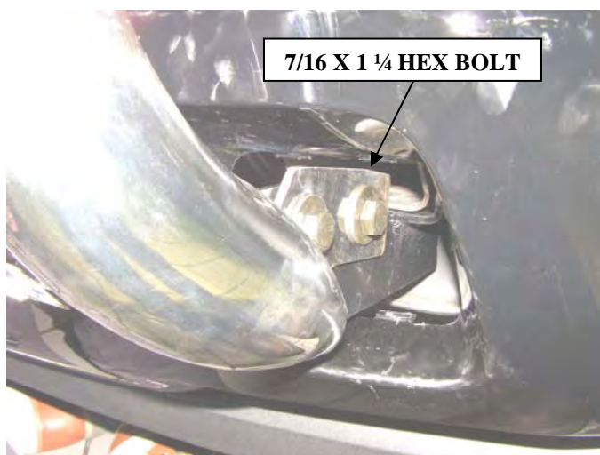
Fig 3 ( Driver Side)

For Technical Support/Warranty Information please call 310-762-9944