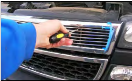
Figure 3 – Attach Upper Billet Grille piece