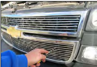
Figure 4 – Attach lower Billet Grille piece

For Technical Support/Warranty Information please call 310-762-9944