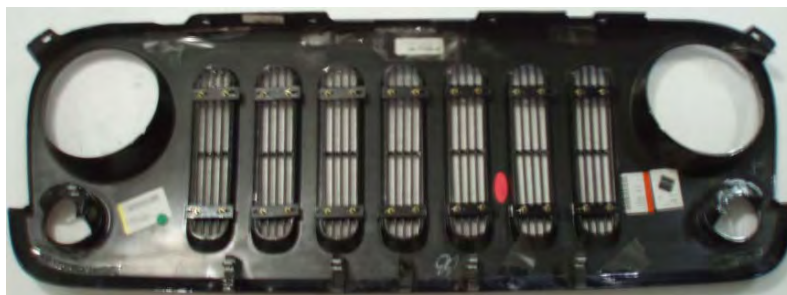
Figure 3 – Rear view of vehicle's shell; Billet Grills attached with Metal Brackets and Flange Nuts