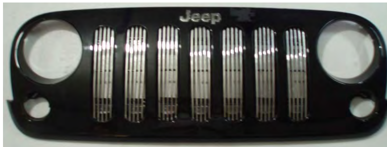
Figure 2 – Front View of positioning lower Billet Grille