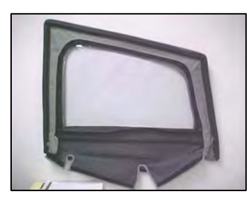
Door Skin Velcro Open

2. Insert the frame into the upper rear corner of the door skin and then insert the Frame into the upper front corner of the Door Skin. Press down the Velcro to secure the frame bar.