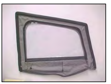
Driver Side Door Skin