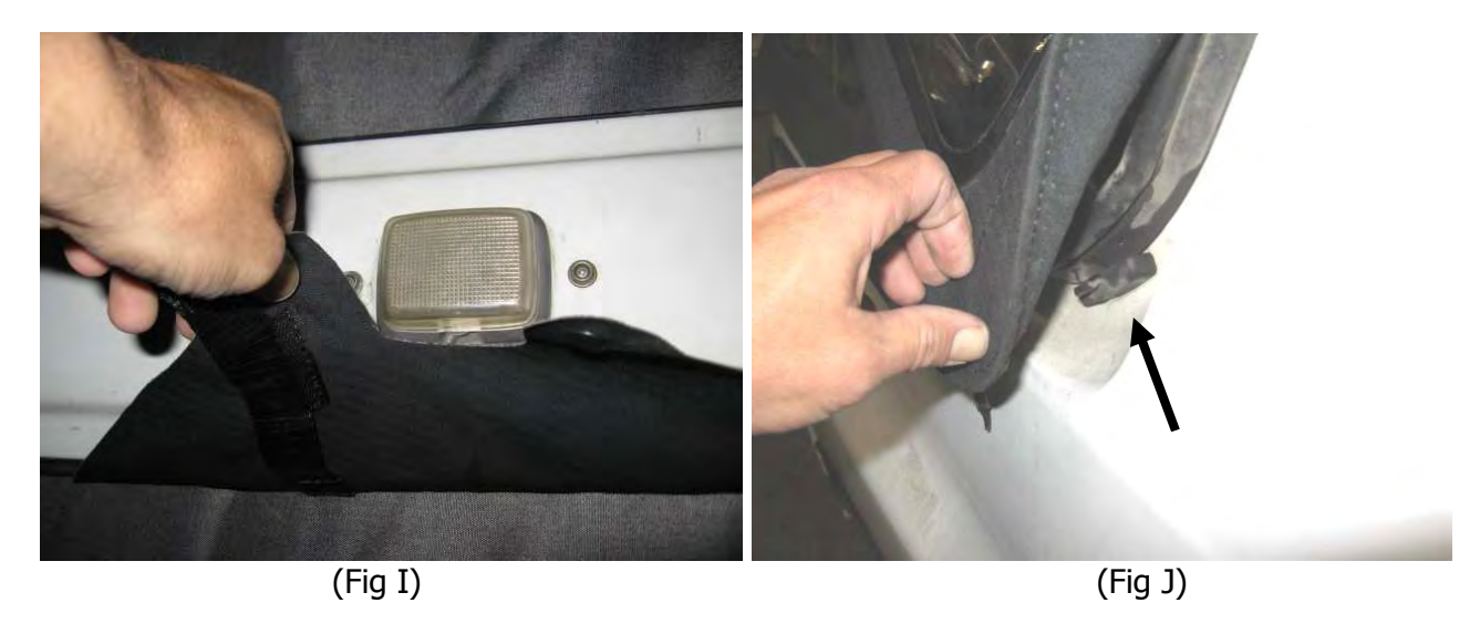
Step 9: Push the side windows back towards the vehicle and latching the retainer bar into the factory bracket located on the vehicle. Secure inside with retainer bar strap also. (Fig J, K)