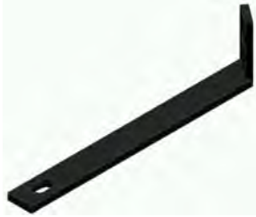
1500/2500/3500 Front Brace