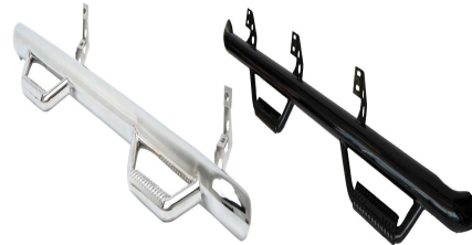
Picture is for sample use, may not be actual bars

STEP 1: Identify the driver and passenger side bars. (The short 45 degree bend at the end of each nerf-step goes towards the front of the vehicle.)