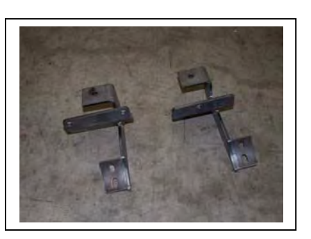
Fig 2 Driver side brackets