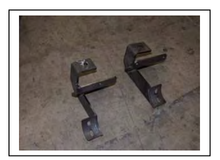
Fig 1 Passenger side brackets