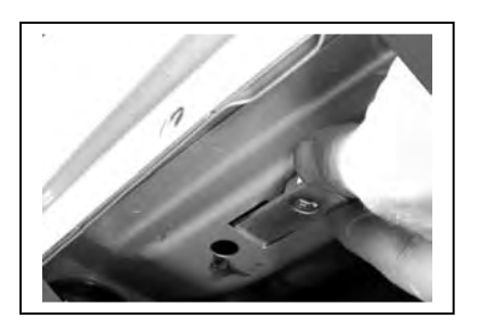
Fig 4 Driver side front shown

Fig 3. Thin foam adhesive tape. Driver side front