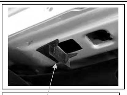
Fig 3. Thin foam adhesive tape. Driver side front

Sure-Step (Part # JN48-S2) 07 Jeep Wrangler JK 2 Door