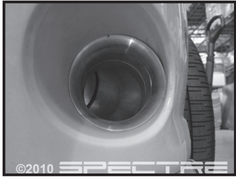
Step 3 With the fog light removed, use the 4" holesaw and drill out the back of the fog light bracket. Insert funnel in place of fog light.