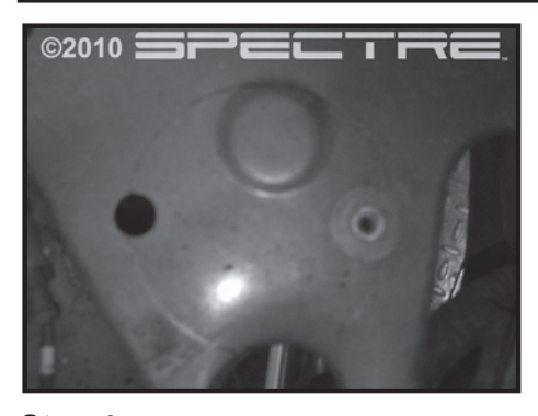
Step 4 Once the funnel is in place and lined up, temporarily install tube to see where you need to cut the top hole. Looking through the existing holes in the sheet metal, you can see enough of the tube to line up a 4" circular template (we made one from a piece of paper). You are then able to mark where you need to cut with a permanent marker and then remove the tube.