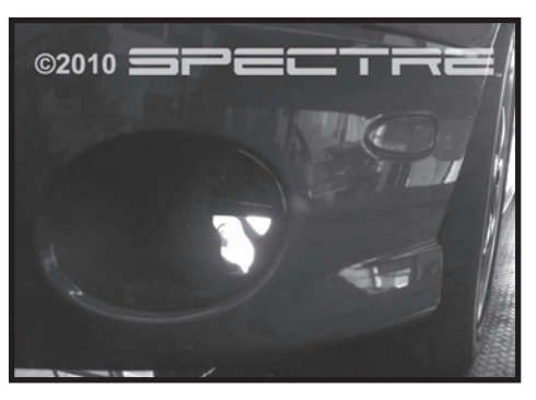
Step 2 Remove the three nuts from the back of the fog light and remove fog light housing from the car.