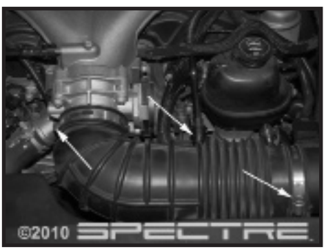
Step 3 Disconnect the PCV breather line from the back of the factory intake tube. Loosen the two clamps at both ends of the intake tube and remove the factory air intake tube.