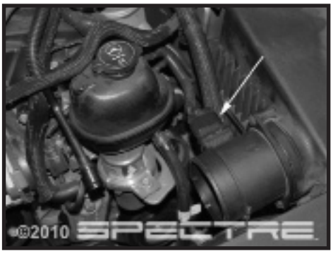
Step 4 Disconnect the Mass Air Flow Sensor (MAFS) electrical connector.