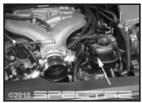
Step 13 Remove the factory PCV breather line, disconnected in Step 3, which traces to the back of the engine.