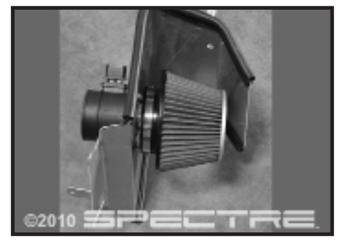
Step 7 Install the MAFS onto the heatshield making sure the supplied gasket is placed between the MAFS and the heatshield. Use supplied hardware to fasten securely. Install the rubber bulb seal on the heat shield as shown. Install the filter onto the tube, then tighten the clamp.