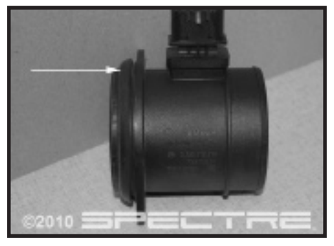
Step 6 Remove the MAFS from the factory airbox and remove the seal from the MAFS.