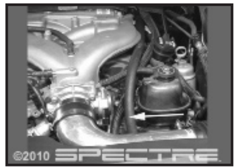
Step 16 Install the new PCV breather line supplied in the kit. Once in place securely fasten with clamps provided.