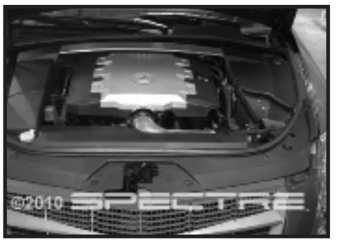
Step 18 Remove the oil fill cap then install the engine cover as well the driver side inner fender cover. Reinstall the oil fill cap once the cover has been installed.