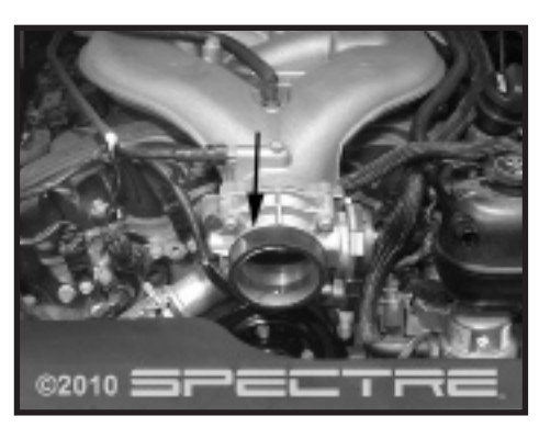
Step 11 Install the throttle body adapter onto the throttle body.