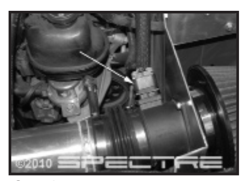
Step 17 Reconnect the mass air flow sensor electrical sensor.