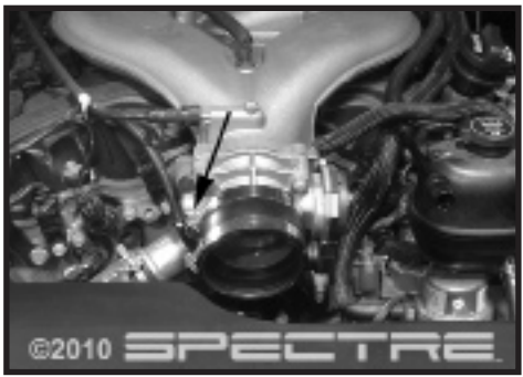
Step 12 Install the coupler onto the throttle body. Tighten the clamp on the throttle side and make sure the intake side clamp is installed but left loose.