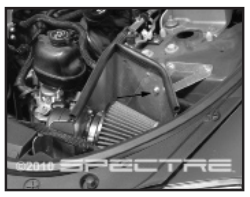
Step 10 Install the heatshield as shown using supplied hardware against the bracket and reinstalling the bolt that was removed in step 9.