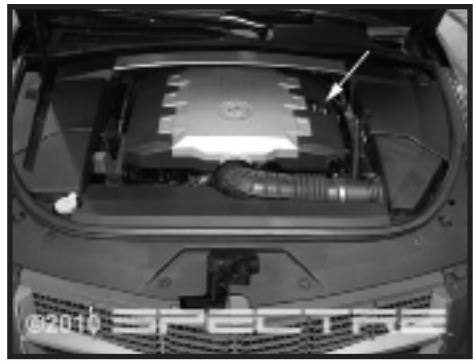
Step 2 Remove the oil fill cap then lift and remove the engine cover as well the driver side inner fender cover. Reinstall the oil fill cap once the cover has been removed.

Safety first! Before you begin the installation, make sure that the vehicle is in park (or neutral for a manual transmission) with the parking brake set. Disconnect the negative battery terminal and verify that all components that are listed are present. Note: This kit was designed and tested on a stock engine without any custom tuning done to the engine computer. Removing the battery cable may erase the programmed radio stations. The anti-theft code will need to be entered into some radios after the battery cable is connected. The anti-theft code can typically be found in the owner's manual or at your local dealership.