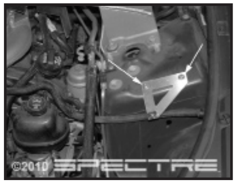
Step 8 Install the heat shield bracket as shown in the image.