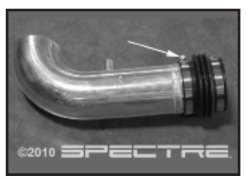
Step 14 Install the flex coupler onto the intake tube. Tighten the clamp on the intake tube side and make sure the MAFS side clamp is installed but left loose.