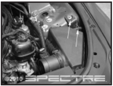
Step 5 Unclip the radiator hose from the clip on the side of the air box. Remove the bolt on the air box and then lift the air box assembly up and out of the engine bay.