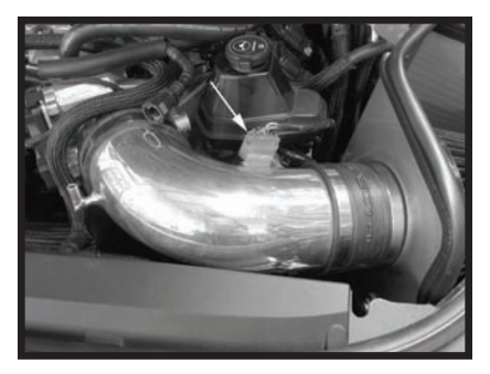
Step 19 Reconnect the mass air flow sensor electrical sensor.