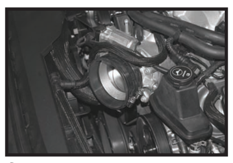
Step 9 Install the 4" coupler onto the throttle body. Tighten the clamp on the throttle side and make sure the intake side clamp is installed but left loose.