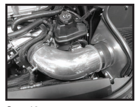
Step 18 Install the intake tube into the coupler on the heat shield and then into the coupler on the throttle body. Tighten all clamps.

Place the filter assembly in the heat shield and install the coupler secondly, making sure the flex boot is pushed completely against the heat shield. Once the adapter and flex boot are tight against the heatshield, fully tighten the clamp.