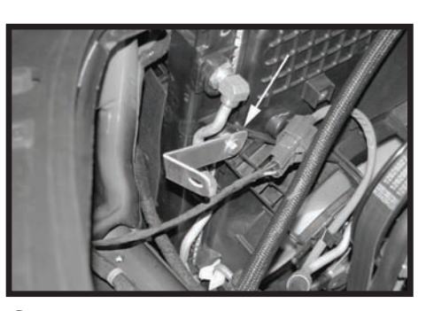
Step 12 Install the heat shield bracket with the supplied spacer between the heatshield bracket and the fan shroud using the supplied hardware.