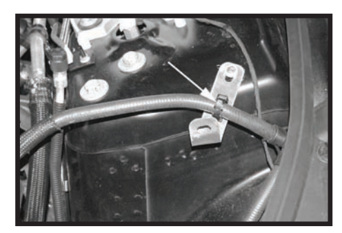
Step 11 Install the heat shield bracket as shown in the image. Install the factory hose clip removed from previous step onto bracket as shown.