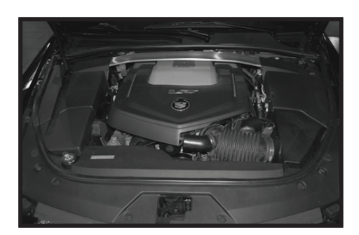
Step 2 Lift and remove engine cover.

Safety first! Before you begin the installation, make sure that the vehicle is in park (or neutral for a manual transmission) with the parking brake set. Disconnect the negative battery terminal and verify that all components that are listed are present. Note: This kit was designed and tested on a stock engine without any custom tuning done to the engine computer. Removing the battery cable may erase the programmed radio stations. The anti-theft code will need to be entered into some radios after the battery cable is connected. The anti-theft code can typically be found in the owner's manual or at your local dealership.