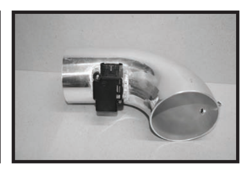
Step 7 Install the MAFS into the aluminum intake tube.