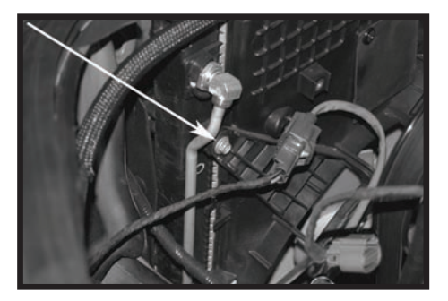
Step 8 Remove the bolt pictured that is supporting the fan shroud.