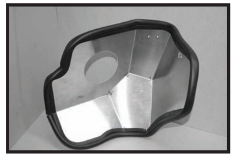
Step 13 Install the rubber bulb seal on the heat shield as shown.