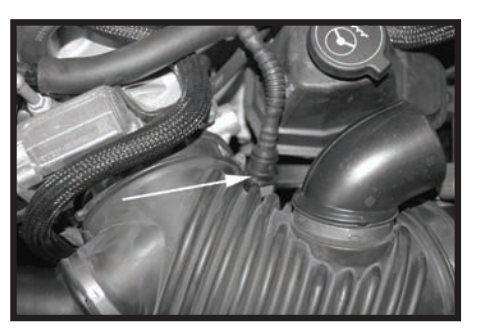
Step 3 Disconnect the PCV breather line from the back of the factory intake tube.