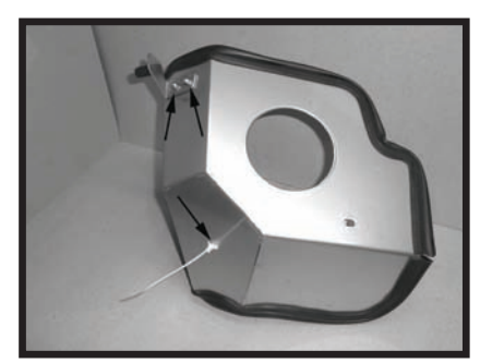
Step 14 Install the engine cover bracket to the heat shield using the supplied hardware. Also install the supplied zip tie into the hole in the heat shield.