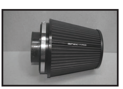
Step 15 Assemble the air filter with the velocity stack adapter and tighten clamp.