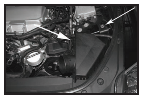
Step 5 Unclip the radiator hose from the clip on the side of the air box. Remove the bolt on the air box and then lift the air box assembly up and out of the engine bay.