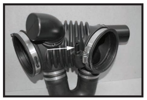
Step 20 Remove the PCV breather fitting from the back of the factory intake tube.