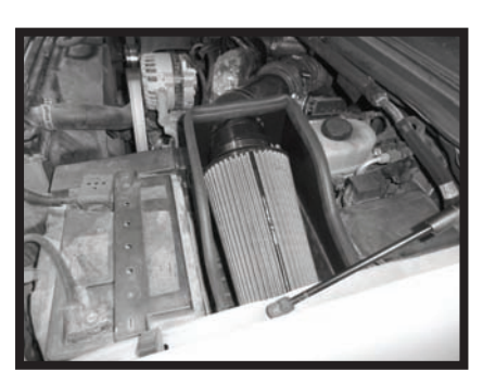
Step 11 Install the filter and fasten it securely.