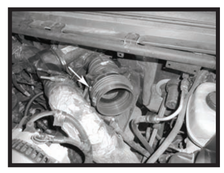
Step 8 Install the flex coupler on the turbo inlet. Install a second clamp but do not tighten at this time.