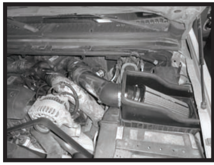
Step 12 Make sure that all clamps and hardware are fully tightened. Reconnect the battery cable, start the vehicle and let it warm up. Shut off and inspect the installation once more for any loose clamps, wires, or hardware. Test drive & enjoy! Your installation is now complete. Periodically check all clamps.