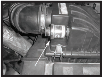
Step 2 Remove the filter minder from the factory air box then remove the filter minder grommet from the factory air box. Some vehicles are equipped with an electronic filter minder, if so disconnect the factory wire harness clip.

Safety first! Before you begin the installation, make sure that the vehicle is in park (or neutral for a manual transmission) with the parking brake set. Disconnect the negative battery terminal and verify that all components that are listed are present. Note: This kit was designed and tested on a stock engine without any custom tuning done to the engine computer. Removing the battery cable may erase the programmed radio stations. The anti-theft code will need to be entered into some radios after the battery cable is connected. The anti-theft code can typically be found in the owner's manual or at your local dealership.