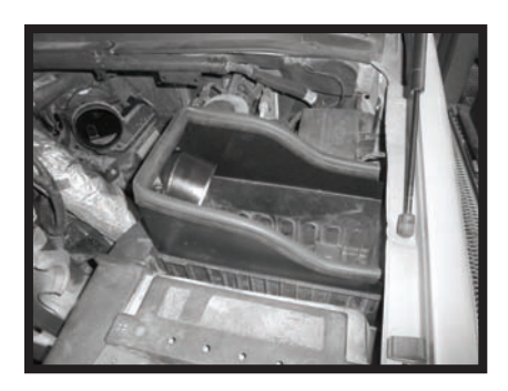
Step 7 Install the heat shield making sure that the tabs on the heat shield are inserted into the lower factory airbox slots, then clip the back section down inside the airbox.