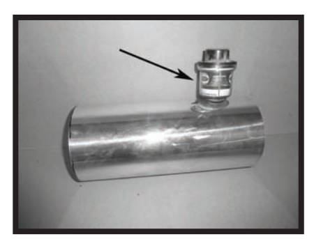
Step 5 Install the grommet into the new Spectre Performance intake tube. Install the filter minder into the grommet.