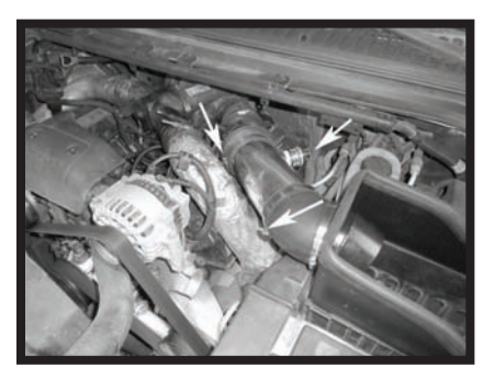
Step 10 Install the Spectre Performance intake tube into the flex coupler first then into the angled coupler with the filter minder closer to the turbo. Once the tube is in position and the filter minder is facing the firewall, tighten the clamps. If you have an electronic filter minder, reconnect the factory wire harness clip.