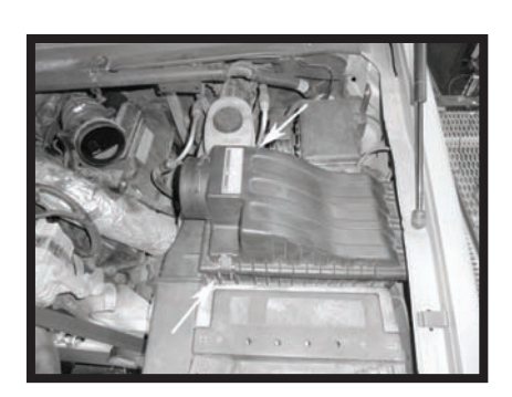
Step 4 Unclip the air box cover from both sides and pull up and out. Remove the air filter from the air box.