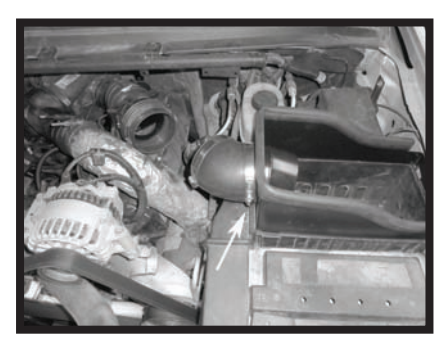
Step 9 Install the angled coupler on the heat shield. Install a second clamp but do not tighten at this time.