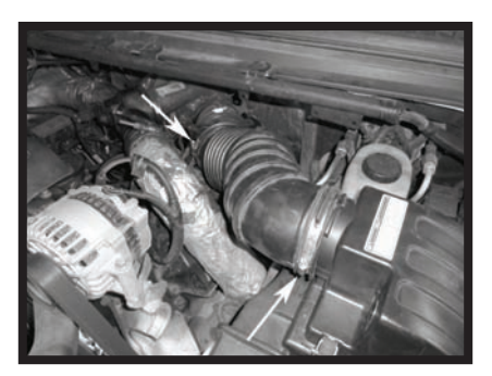
Step 3 Loosen the clamps on the factory intake tube and remove the intake tube from the vehicle.