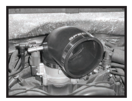
Step 14 Install two hose clamps on the 90° coupler and install it on the throttle body. Do not tighten the coupler clamp until the product is fully assembled and positioned properly.