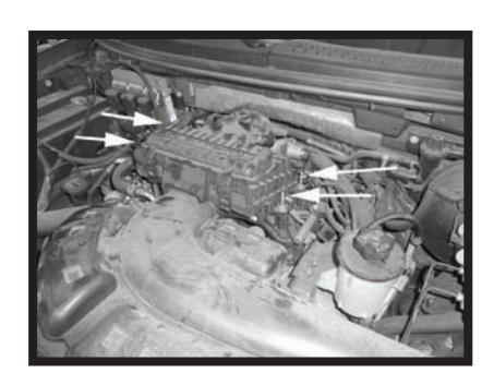
Step 5 Remove the four mounting bolts for the air box and then remove the entire factory air box from the vehicle.