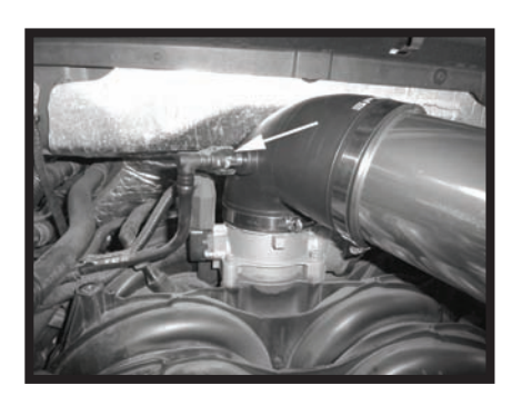
Step 16 Reconnect the factory PCV hose to the fitting on the 90° coupler.