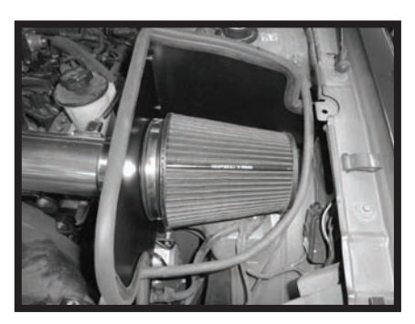
Step 17 Install the filter and fully tighten the clamp.