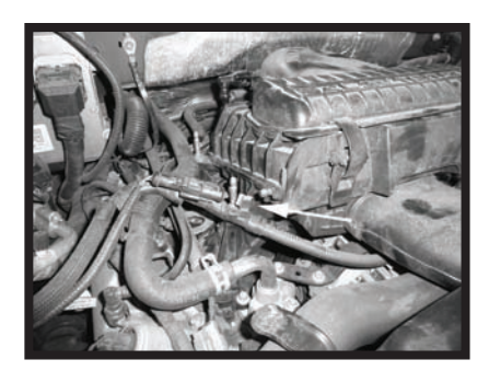
Step 4 Disconnect the wiring harness that is clipped to the factory airbox.