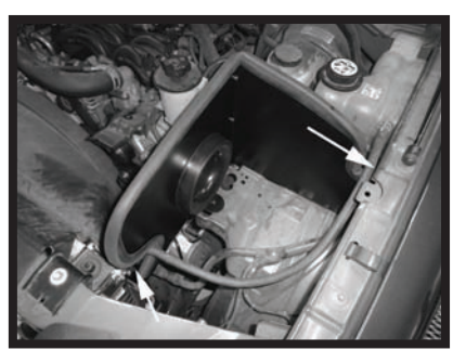
Step 12 Install the heat shield reusing the hardware removed in Step 9 and 10.