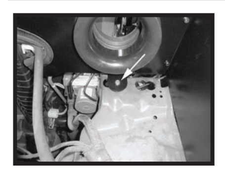
Step 13 Install the bolt and fender washer from the top side of the bracket. Then install the lower mounting spacer and fasten securely in place with the supplied fender washer and nut.