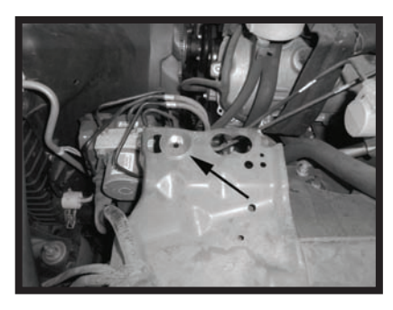
Step 11 Install the heat shield upper mounting spacer as shown.