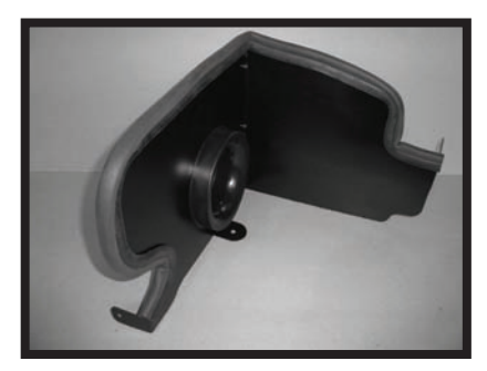
Step 8 Assemble the heat shield with the tabs placed on the outside of heat shield. Install the rubber bulb seal. Place the velocity stack adapter in the heat shield and install the supplied flex coupler making sure the coupler is pushed completely against the heat shield. Once the adapter and coupler are tight against the heat shield, tighten the clamp.