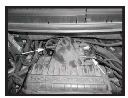
Step 3 Disconnect the Mass Air Flow Sensor (MAFS) connector and the breather hose (PCV) from the air box.