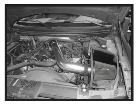
Step 18 Make sure that all clamps and hardware are fully tightened. Reconnect the battery cable, start the vehicle and let it warm up. Shut off and inspect the installation once more for any loose clamps, wires, or hardware. Test drive & enjoy! Your installation is now complete. Periodically check all clamps and brackets.

If you have any difficulties or questions regarding the installation of this intake system, contact the Spectre Performance Technical Department by email - Tech@spectreperformance.com or by phone(909) 673-9800 Monday thru Friday 6:00am to 2:00pm PST.