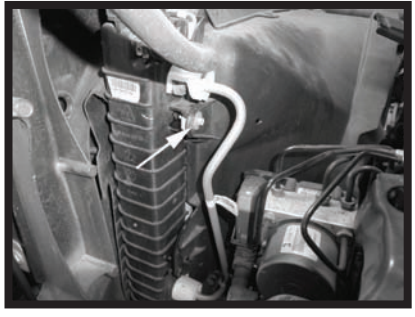
Step 10 Remove the bolt holding the radiator shroud. This will be reused in Step 12.