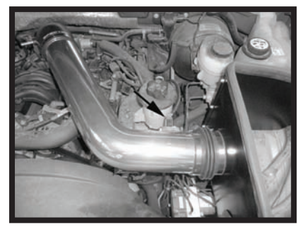
Step 15 Install the intake tube into the 90° coupler with the MAFS located near the heat shield. Reroute the MAFS harness to the new MAFS location and reconnect it. Insert the other end of the intake tube (ensure that the MAFS sleeve from Step 7 is still in place) to the flex coupler at the heat shield. Once the tube is in the desired position and resting on the factory tube support, fully tighten all clamps.