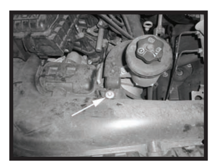
Step 2 Remove the intake tube bolt.

Safety first! Before you begin the installation, make sure that the vehicle is in park (or neutral for a manual transmission) with the parking brake set. Disconnect the negative battery terminal and verify that all components that are listed are present. Note: This kit was designed and tested on a stock engine without any custom tuning done to the engine computer. Removing the battery cable may erase the programmed radio stations. The anti-theft code will need to be entered into some radios after the battery cable is connected. The anti-theft code can typically be found in the owner's manual or at your local dealership.