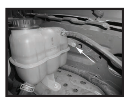
Step 9 Remove the bolt holding the overflow tank to the inner fender. This will be reused in Step 12.