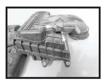
Step 6 Remove the MAFS from the air box.