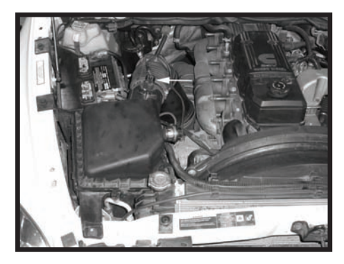
Step 2 Disconnect the electrical connector at the intake temperature sensor located on top of the factory airbox.

Safety first! Before you begin the installation, make sure that the vehicle is in park (or neutral for a manual transmission) with the parking brake set. Disconnect the negative battery terminal and verify that all components that are listed are present. Note: This kit was designed and tested on a stock engine without any custom tuning done to the engine computer. Removing the battery cable may erase the programmed radio stations. The anti-theft code will need to be entered into some radios after the battery cable is connected. The anti-theft code can typically be found in the owner's manual or at your local dealership.