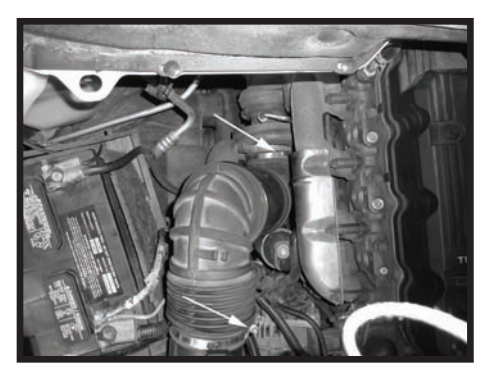
Step 3 Loosen the clamp on the factory tube to factory air box and the clamp at the turbo. Remove the factory tube from the vehicle.