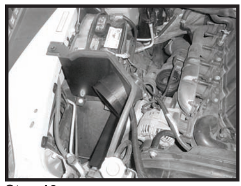
Step 10 Place the velocity stack adapter in the heat shield and install the supplied 22° flex boot making sure the coupler is pushed completely against the heat shield. Once the adapter and coupler are tight against the heat shield, snug the clamp to hold it in place but do not tighten at this time. Make sure that the clamp for the intake tube is installed but left loose at this time.