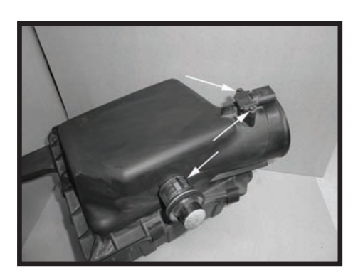
Step 5 Remove the intake temperature sensor and the air filter minder .