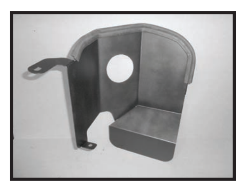
Step 7 Install bulb seal around edges of heat shield as shown.