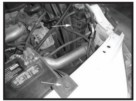
Step 8 Remove the two factory bolts that are pointed out. These will be reused in the next step.