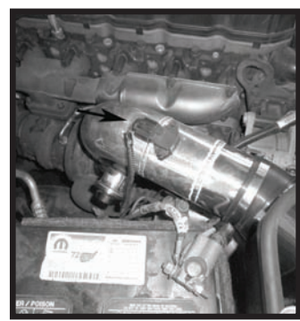
Step 13 Reconnect the intake temperature sensor.