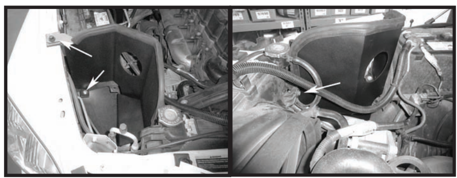
Step 9 Install heatshield using the factory hardware removed from Step 8 and supplied hardware for third mounting location. Make sure the tab is between the radiator and the fan shroud for proper fitment.