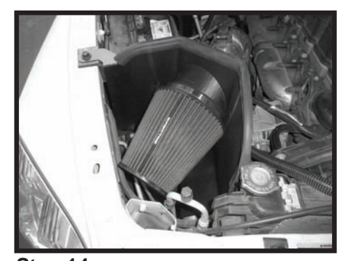
Step 14 Install the supplied air filter and clamp and tighten the clamp that secures the air filter. Rotate the air filter/velocity stack adapter assembly for the maximum clearance as shown. Make sure that the velocity stack adapter and coupler are still tight against the heat shield then fully tighten all clamps.