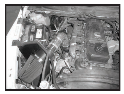
Step 15 Reconnect the battery cable, start the vehicle and let it warm up. Shut off and inspect the installation once more for any loose clamps, wires, or hardware. Test drive & enjoy! Your installation is now complete. Periodically check all clamps and brackets.

If you have any difficulties or questions regarding the installation of this intake system, contact the Spectre Performance Technical Department by email - Tech@ spectreperformance.com or by phone (909) 673-9800 Monday thru Thursday 6:00am to 4:30pm PST.