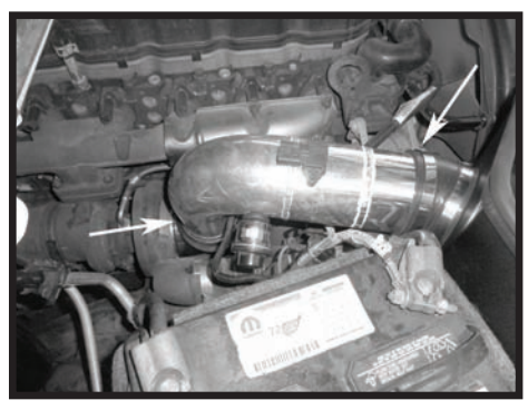
Step 12 Install the intake tube into the vehicle, position it as shown and once tube is in desired location fasten securely.