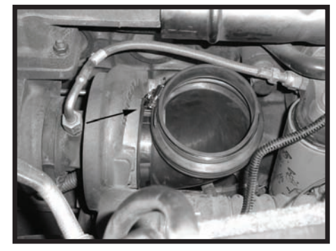
Step 6 Install the 90° coupler onto the turbo and take note of the orientation of the coupler with the non-flex end on turbo . Snug the clamp on the turbo side allowing for adjustment in later steps and make sure the intake tube clamp is installed but left loose until the intake tube is installed.