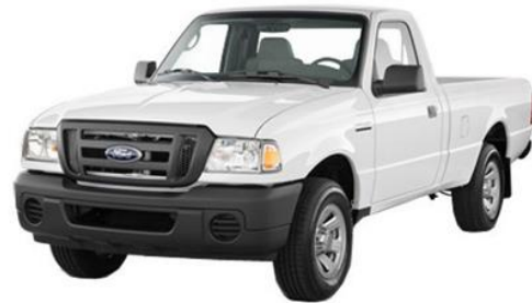
Mounting Kit included