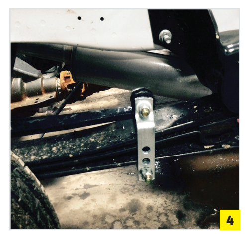
On vehicles with STAMPED steel leaf spring mounts: either the lower or middle hole of the SSA43 shackle may be used.