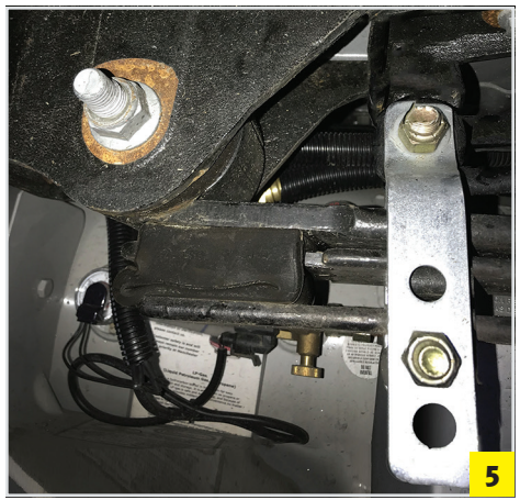
On vehicles with CAST steel leaf spring mounts: the middle hole of the SSA43 shackle MUST be used.