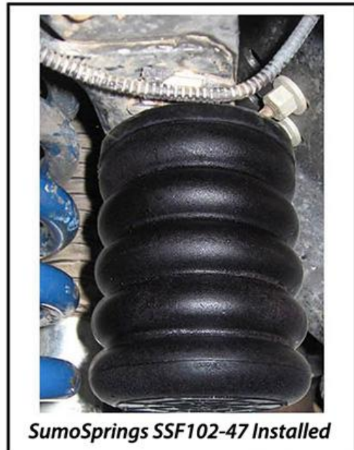
SumoSprings SSF102-47 Installed

Refer to SumoSprings application guide for part selection www.supersprings.com [Tech line #866-898-0720] SumoSprings enhance load carrying capability, handling & towing. Never exceed vehicle manufacturer's GVWR rating.