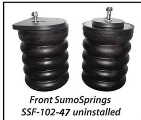
Front SumoSprings SSF-102-47 uninstalled