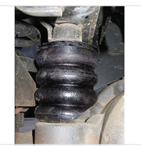
Drivers Side Installed - The notched SumoSprings is installed on the drivers side