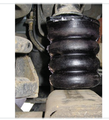
Passengers Side Installed

PART NUMBER: SSF-302-47 PRODUCT LINE: SumoSprings VER:20190610