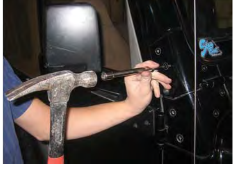
5. Remove the two top counter sink bolts from the front windshield bracket with a torx key #40 Note: In order to loosen the bolts, tap them lightly with a hammer to loosen the Loc tite.