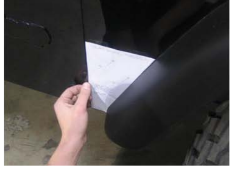
2. Align template along the side base of the jeeps passenger fender. Tape the template to the fender.