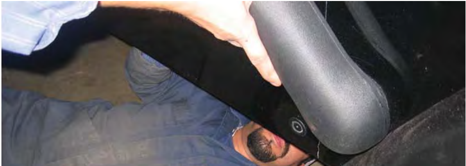
11. Insert the 3" opening of the Volant riser duct into the hole on the fender and into the sleeve. Clamp both ends of the sleeve with two #48 clamps using a 5/16" nut driver. With the ¼" washer, lock washer and nut bolt the set screw to the vehicle from the inside of the fender and tighten with a 7/16" open wrench. Note: This will need two people.