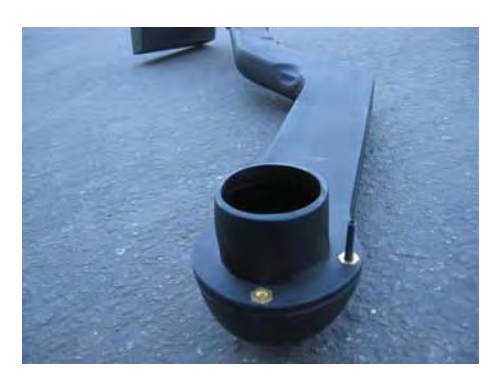
10. Screw the 1/4" -20 set screw using a 1/8" Allen key to the molded insert on the right side of the opening of the Volant riser duct.