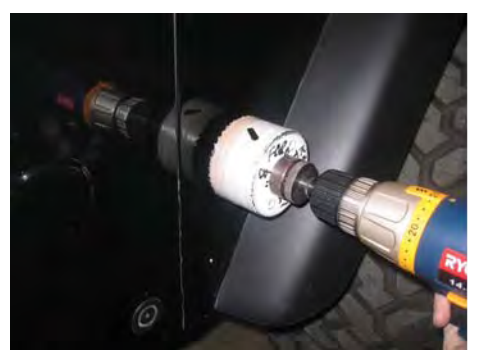
4. Remove the template from the fender. Drill a 3" hole with a hole saw on the top 1/8" pilot hole and a 3/8" hole with a drill bit on the lower pilot hole.