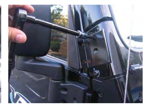
9. Bolt the Volant periscoop bracket onto the windshield bracket using the stock counter sink bolts.

8. Clamp both ends of the 3" sleeve with two of the four #48 clamps to hold the Volant down pipe to the bottom of the filter box.