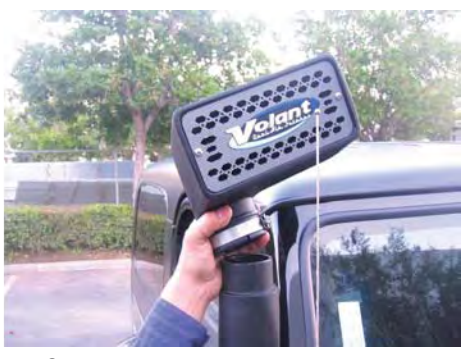
13. Once the Volant Periscoop is mounted and bolted on the vehicle place the Volant Scoop to the top of the Volant riser duct and clamp it down with a 5/16" nut driver