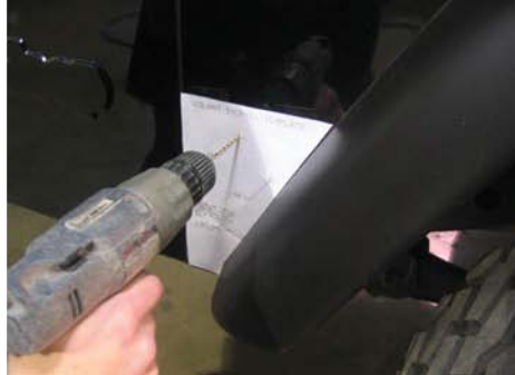
3. Once the template is lined up and taped to the fender, drill two 1/8" pilot holes as noted on the template.