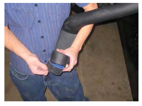
6. Place the 3" X 3" sleeve on the small opening of the Volant down pipe and the 3 ¼" X 2" sleeve on the other end of the short snorkel.