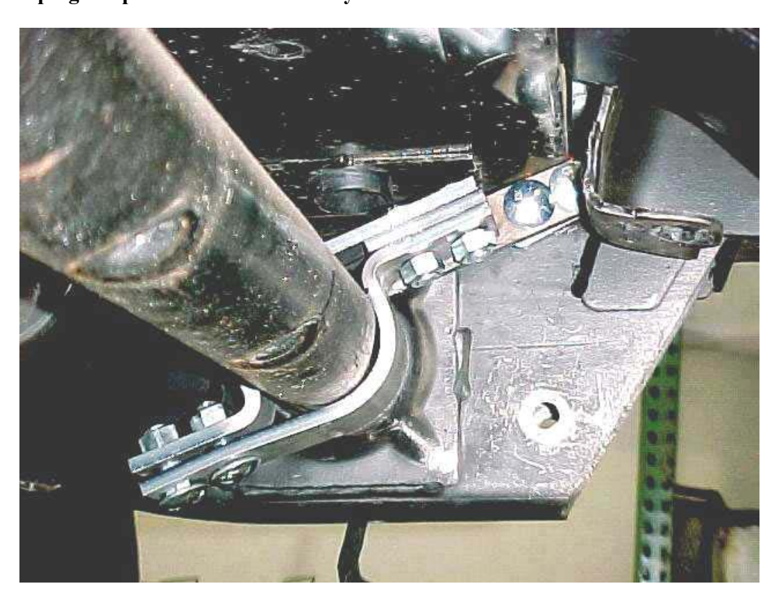
PHOTO 2 – brace assembly (NOTE: use shim washer (unplated) below the spacer to set the elevation. The shim represents the material thickness of the bumper.)