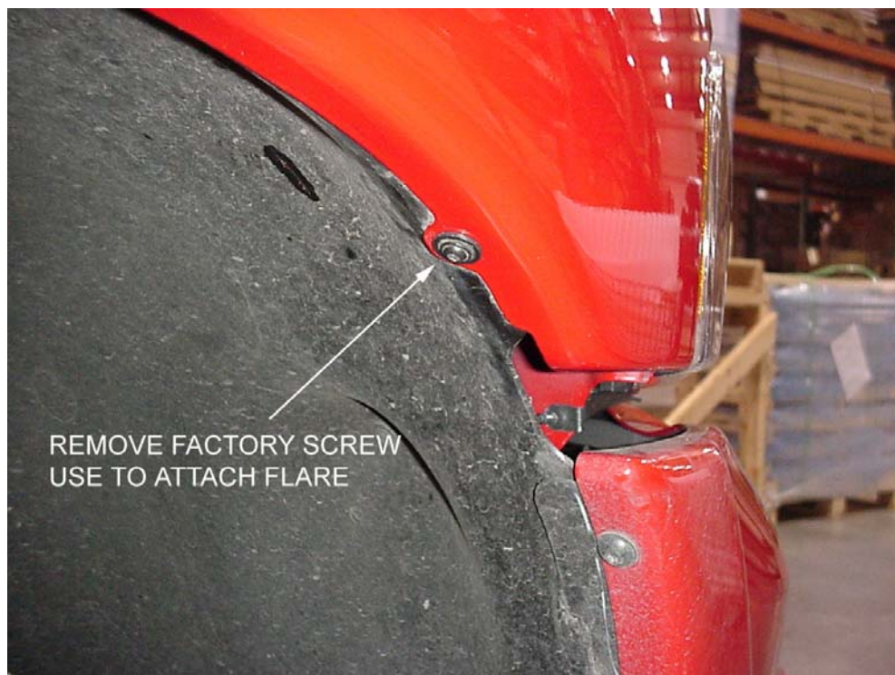
Figure 1 Front factory screw, right side fender