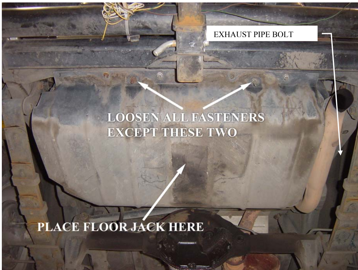
Figure 1: Removal of exhaust bolt, jacking point and Factory skid plate mounting points. NOTE: Having an assistant for the next couple of steps makes the tasks a lot easier.