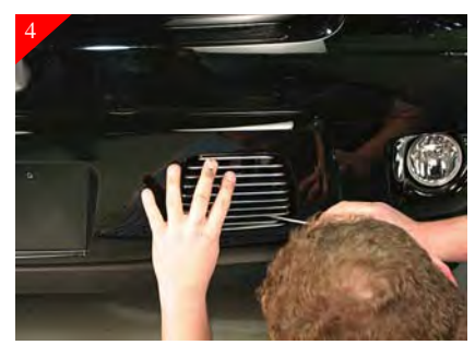
Place billet grille into opening and center. Then using a 90° scribe mark the location of the holes in bracket where it meets the vehicle.