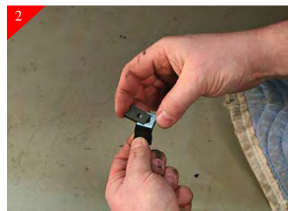
Place the supplied U-clips on the supplied brackets as shown above.