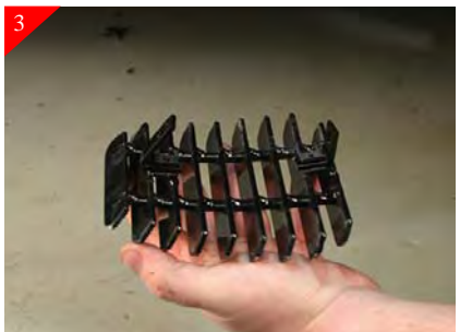
Then attach brackets to billet grille using the supplied #8 x 5/8" Phil pan head screws as shown above.