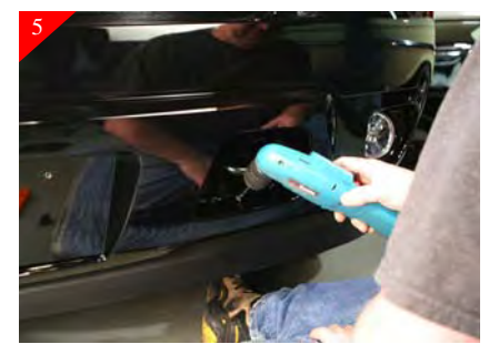
Remove the billet grille from opening and also remove the brackets from the billet grille. Then drill a 3/16" hole in each of the just marked locations.