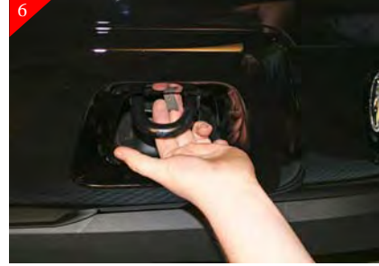
Now attach the brackets to the just marked locations. Attach the top bracket by placing a supplied u-clip on the top side of the tow hook opening as shown above then attach brackets to uclip using #8 x 5/8" Phil pan head screws. Repeat process for the bottom brackets.