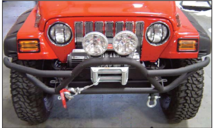
FIGURE 1 Installed Trailblazer Front Bumper Tow accessories sold separately